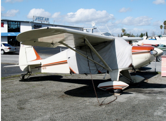
Piper PA-22 Extended Canopy Cover

This cover type is made from Silver Acrylic Sunbrella canvas and is 100% lined with a soft and smooth microfiber. Bruce's Custom Covers developed this material combination especially for aircraft protection. The outer material is medium weight and treated for water resistance, UV resistance and anti-static buildup. The inner lining is a very soft and smooth microfiber to prevent scratching. The material is very reflective, and tests show that the cabin interior temperature can be reduced to near-ambient temperature on the hottest of days. It is water, ice and snow repellent, yet breathable to allow moisture to escape from between the cover and the aircraft surface.