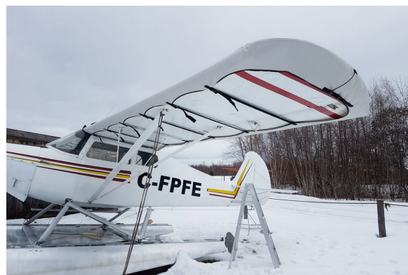
Christavia MK1 Wing Covers