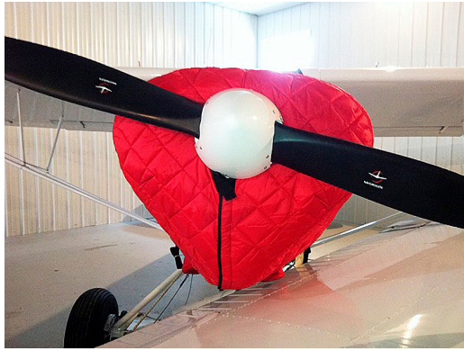
Piper PA-18 Super Cub Insulated Engine Cover

Insulated Covers Material - A special composite material of solution-dyed polyester, 3M Thinsulate insulation, and soft nylon interior fabric. Our insulated covers are designed to complement an engine preheater and help retain heat in the engine compartment after shutdown. If you operate your aircraft in cold-weather, these covers will help prevent engine wear and tear.