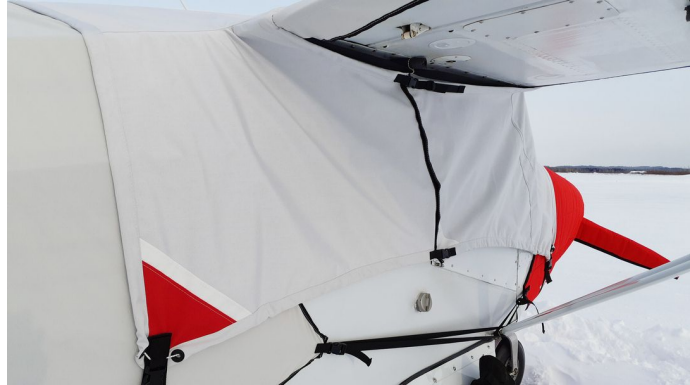
1957 PA-22-150 Empennage Cover (Tailboom, Vertical 7 Horizontal Stabilizers)