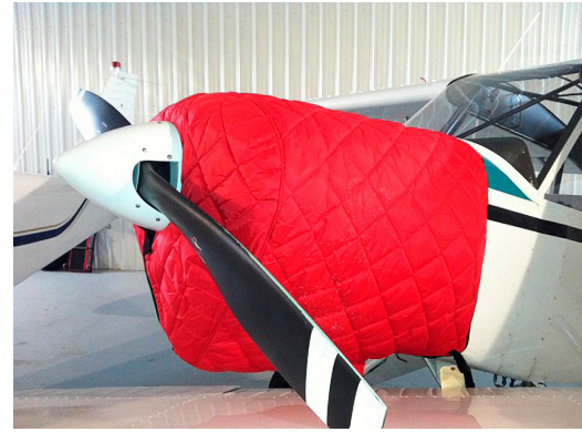
Piper Super Cub Insulated Engine Cover