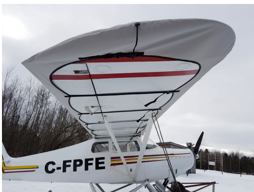
Christavia MK1 Wing Covers

WINTER USE MATERIAL - Made with Solution-Dyed Polyester fabric, this option is intended for seasonal use to aid in deicing, rain mitigation, or for occasional travel. The material is lighter and more compact, but more susceptible to UV damage and may have a shorter useful life if used continuously outside than the all-year use material.