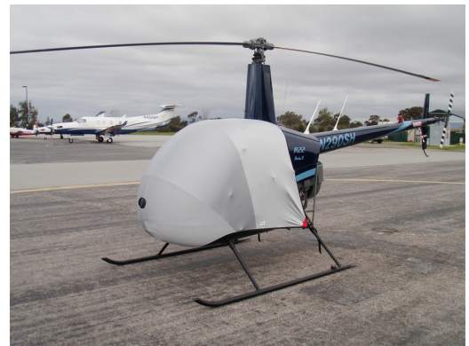
Robinson R-22 Light Weight Travel Cover