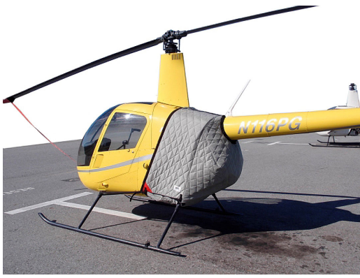
Robinson R-22 Insulated Engine Cover (also covers bottom) & Front Blade Tie-down