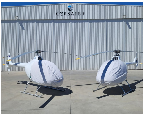
Cabri CG-2 Bubble Cover