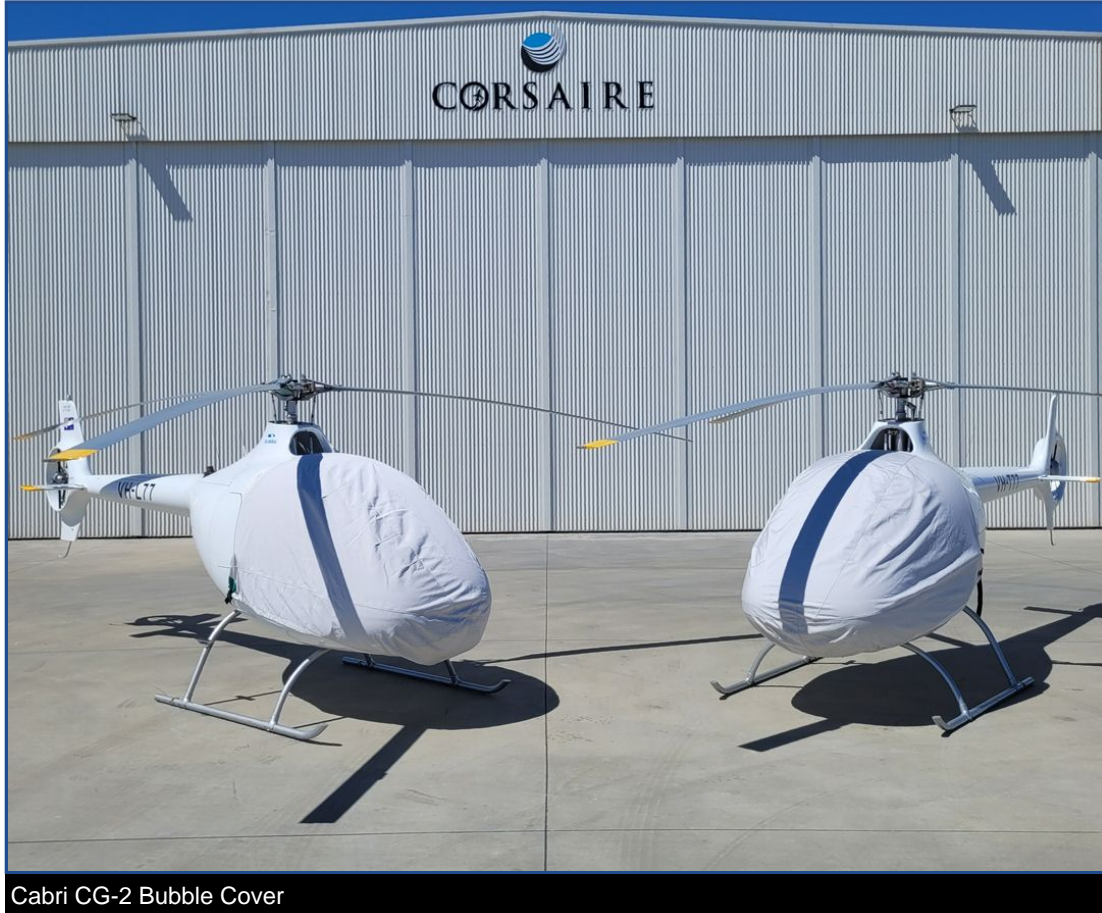
Cabri CG-2 Bubble Cover