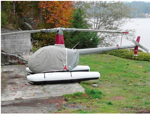
Robinson R-22 Bubble Cover (Ext. Past Rotor Hub), Engine Cover, Tailboom Cover, Blade Covers, Rotor Hub Cover, & Tail Rotor Gear Box Cover