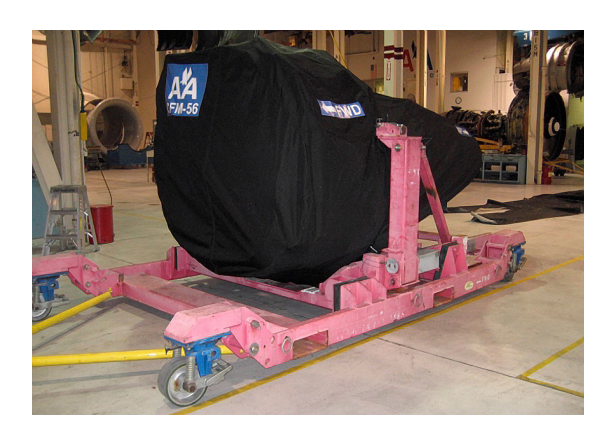
CFM-56-7 Off-link Engine Shipper/Transport cover, w/ Exhaust Cone, fully enclosed