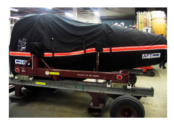
CFM-56-5A/5B Off-link Engine Shipper/Transport cover, w/ Exhaust Cone, fully enclosed