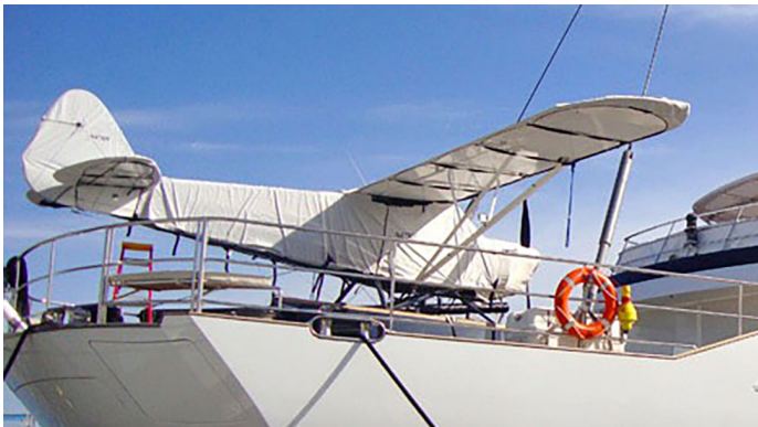
Piper PA-18 Super Cub Complete Cover set

This cover type is made from Silver Acrylic Sunbrella canvas and is 100% lined with a soft and smooth microfiber. Bruce's Custom Covers developed this material combination especially for aircraft protection. The outer material is medium weight and treated for water resistance, UV resistance and anti-static buildup. The inner lining is a very soft and smooth microfiber to prevent scratching. The material is very reflective, and tests show that the cabin interior temperature can be reduced to near-ambient temperature on the hottest of days. It is water, ice and snow repellent, yet breathable to allow moisture to escape from between the cover and the aircraft surface.