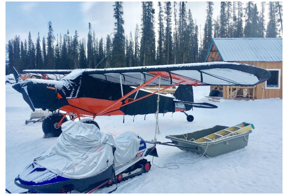
FOR INTERIOR USE. Cub Crafters CC-11 Insulated Hangar Blanket, available in Red or Silver Piper PA-18 Super Cub Canopy Cover (Over-The-Top Style)