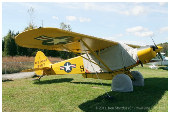
Piper L-21b Extended Canopy Cover, Tire Covers