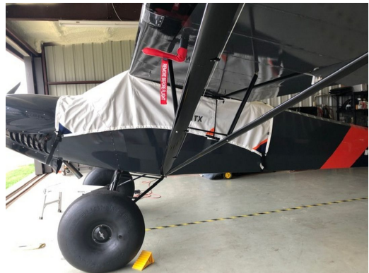
CubCrafters CCK-2000 Over The Top Canopy Cover, Pitot Cover