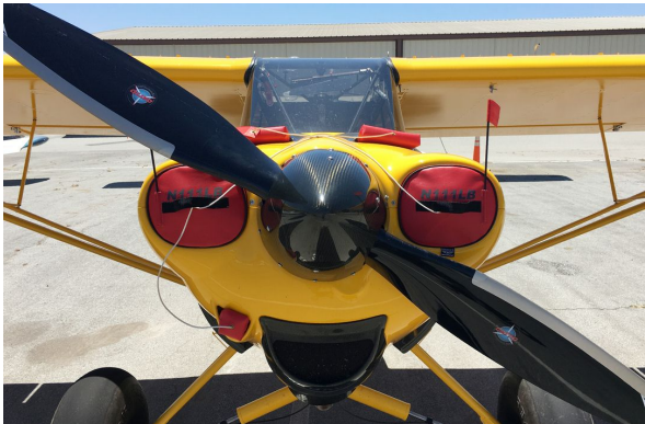
Cub Crafters EX2 Canopy Cover, Engine Plugs Cub Crafters CC-11 Carbon Cub Engine Plugs