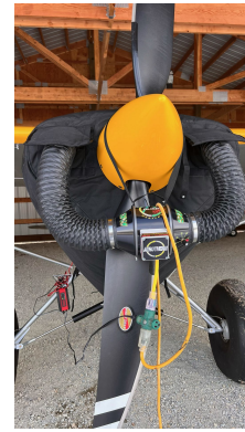
CubCrafters CCX-2000 Insulated Engine Cover