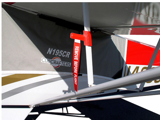
Cub Crafters Sport Cub Pitot Cover

Engine Inlet Plugs are custom fit for your CubCrafters CC-11, Sport Cub S2, & Carbon Cub intakes, made with heavy-duty vinyl material, and stuffed with a single block of sculpted urethane foam. Each plug has a zipper that allows the foam to be removed and dried if necessary. Engine plugs have warning flags that are visible from the cockpit or 'remove before flight' streamers sewn onto the face of the plugs. Most plugs are imprinted with the aircraft registration number in black for an extra charge. Storage bag NOT included. Engine plugs may be inserted after flight when the engine is still warm. Engine Inlet Plugs are commonly referred to as Cowl Plugs, Intake Plugs, Cowl Blocks, Engine Blocks, and Engine Bungs.