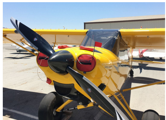
Cub Crafters CC-11 Carbon Cub Engine Plugs