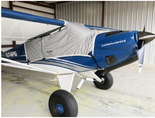
Cub Crafters Carbon Cub Travel Weight Canopy Cover