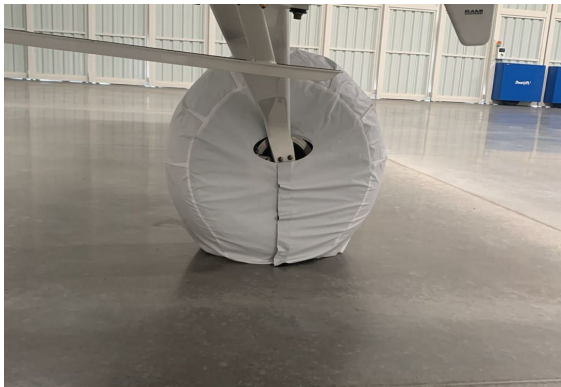
Cub Crafters Tire Covers, tricycle gear, test fit covers