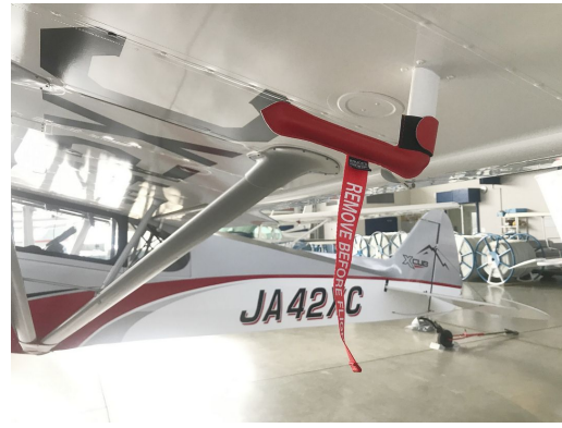
Cub Crafters X Cub CC19-180 Pitot Cover Long L-Type