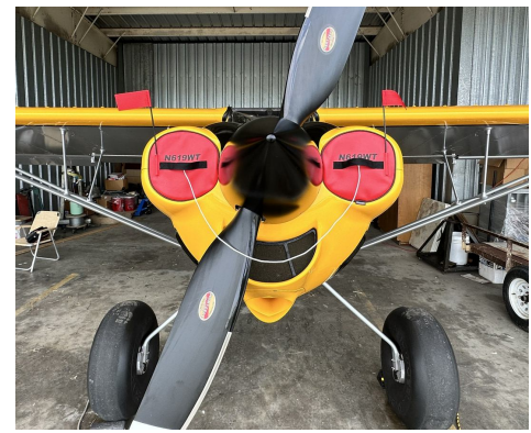
Cub Crafters CC-19 X-Cub Engine Plugs