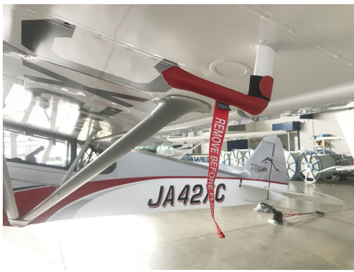
Cub Crafters X Cub CC19-180 Pitot Cover Long L-Type