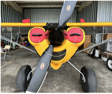
Cub Crafters CC-19 X-Cub Engine Plugs