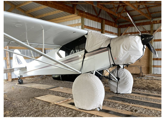
CubCrafters CC-11 Windshield, Engine & Tire Covers