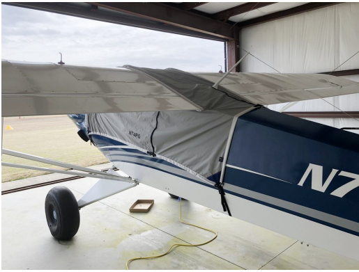
Cub Crafters Carbon Cub Travel Weight Canopy Cover