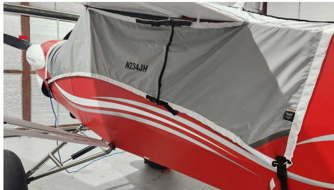
CubCrafters Carbon Cub Travel Canopy Cover