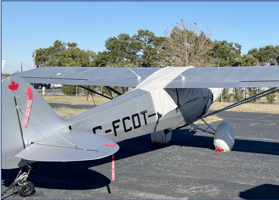
CubCrafters Carbon Cub EX-3 Canopy Cover, Tire Covers