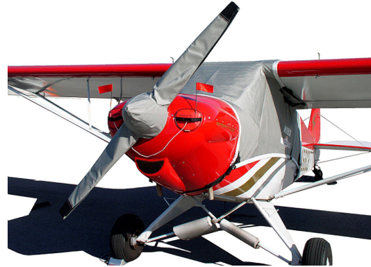
Cub Crafters Sport Cub Prop Cover & Engine Plugs