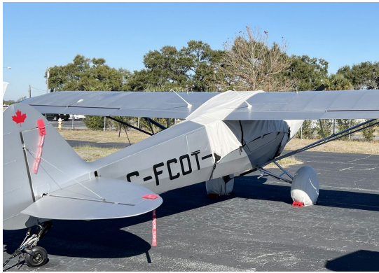
CubCrafters Carbon Cub EX-3 Canopy Cover, Tire Covers

The CubCrafters CC-11, Sport Cub S2, & Carbon Cub Tailcone Cover fits onto the tailcone area to cover the holes that birds can fly into and nest. The cover easily straps onto the leading edge of the horizontal stabilizer with padded hooks or overlaps with the elevators slightly and attaches under the horizontal stabilizers with adjustable straps. Tailcone Covers are normally made with Solution-Dyed Polyester or Acrylic Sunbrella .