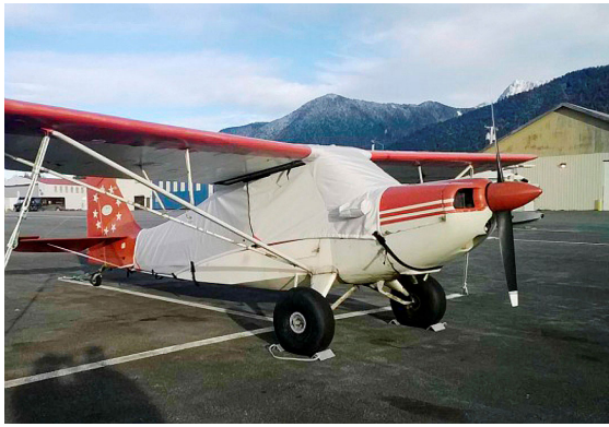
Bellanca Citabria Over-Top Canopy Cover, extended to tail