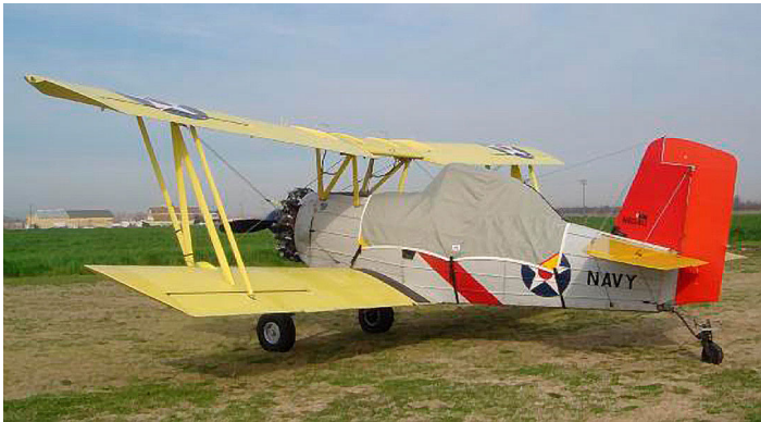
Grumman Ag Cat Canopy Cover