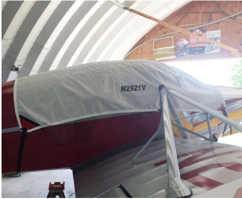
Callair A-2 Canopy Cover

Canopy Covers are commonly referred to as Cabin Covers, Fuselage Covers, Canvas Covers, Canopy Caps, etc.