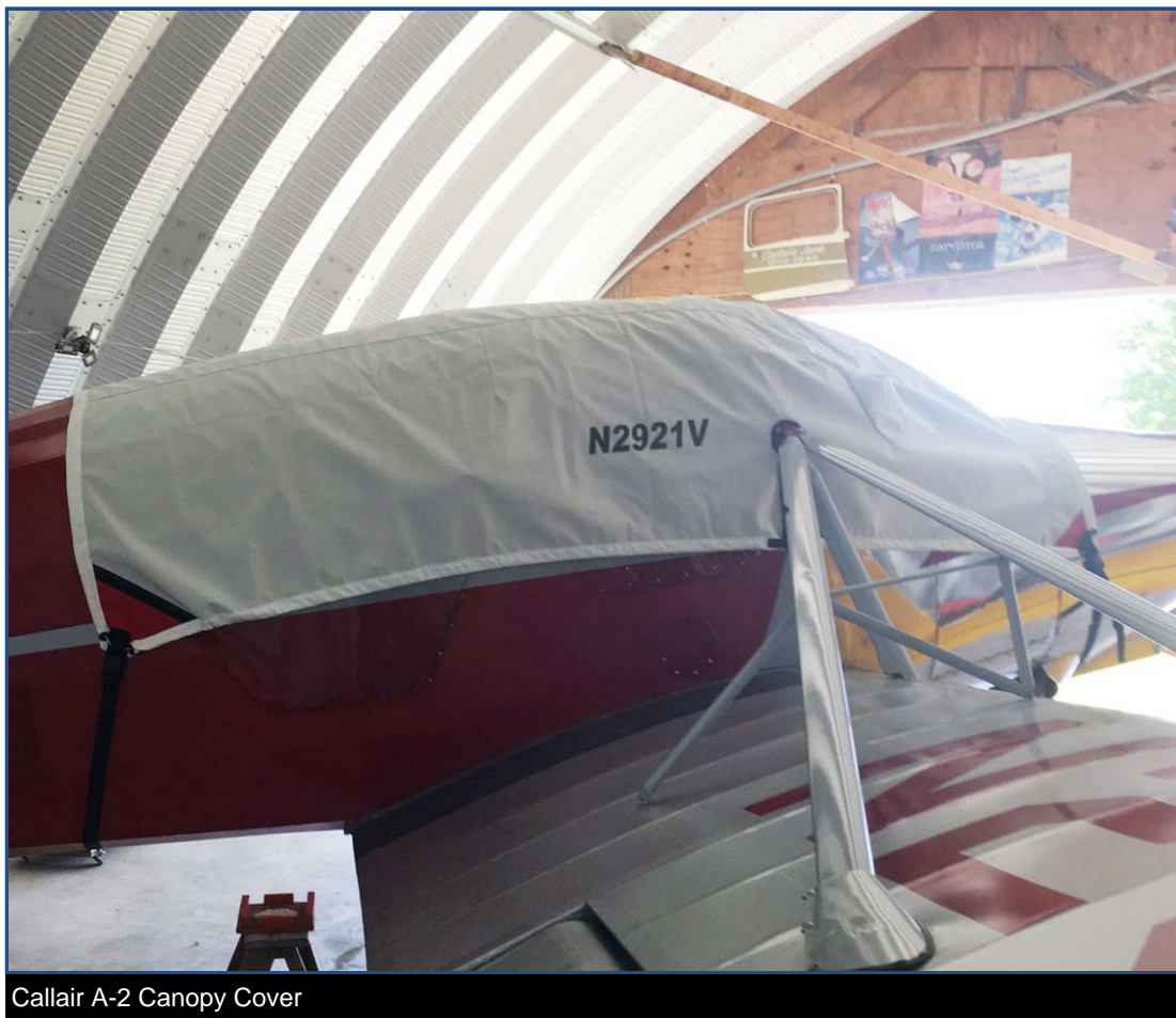
Callair A-2 Canopy Cover