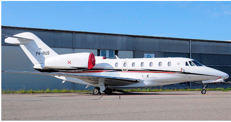
Citation X Intake & Pitot Tube Covers