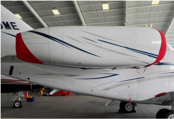
Citation X Intake/Exhaust Cover Set