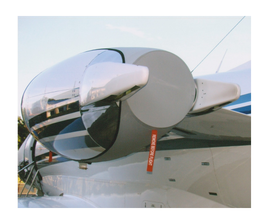
Citation XL Bikini Style Engine Covers