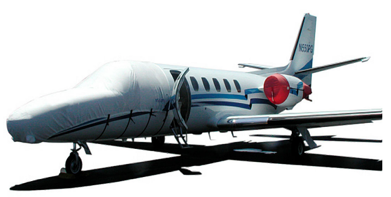
Cessna Citation Nose/Cockpit Cover, Engine Covers