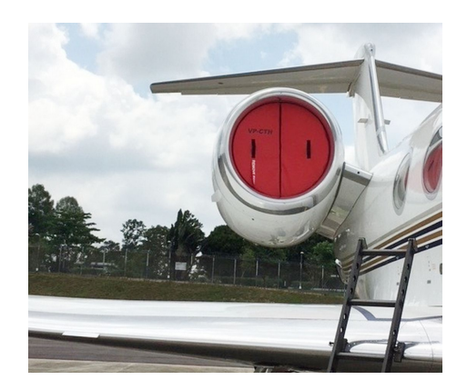
Grumman Gulfstream G450 Intake Plugs

The Engine Inlet Plugs are custom fit for your Cessna Citation Latitude (680A) intakes, made with heavy-duty vinyl material, and stuffed with a single block of sculpted urethane foam. Each plug has a zipper that allows the foam to be removed and dried if necessary. Engine plugs have 'remove before flight' streamers sewn onto the face of the plugs. Most plugs are imprinted with the aircraft registration number in black for an extra charge. Storage bag NOT included. Engine plugs may be inserted after flight when the engine is still warm. Engine Inlet Plugs are commonly referred to as Cowl Plugs, Intake Plugs, Cowl Blocks, Engine Blocks, and Engine Bungs.