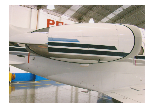
Citation XL Bikini Style Engine Covers

The Cessna Citation Latitude (680A) Intake/Exhaust Plugs are custom fit for the intake and exhaust openings, made with heavy-duty vinyl material, and stuffed with a single block of sculpted urethane foam. Each plug has a zipper that allows the foam to be removed and dried if necessary. Engine plugs have 'remove before flight' streamers sewn onto the face of the plugs. Most plugs are imprinted with the aircraft registration number in black. Engine plugs may be inserted after flight when the engine is still warm. Engine Inlet Plugs are commonly referred to as Cowl Plugs, Intake Plugs, Cowl Blocks, Engine Blocks, and Engine Bungs.