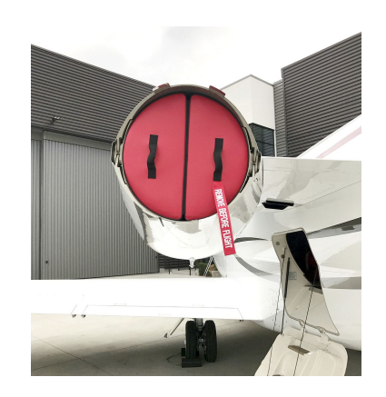
Cessna Citation 680 Exhaust Plugs, folding type