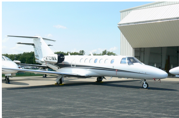
Cessna Citation CJ3 Bikini Style Engine Covers

The Cessna Citation VII (650) Intake/Exhaust Plugs are custom fit for the intake and exhaust openings, made with heavy-duty vinyl material, and stuffed with a single block of sculpted urethane foam. Each plug has a zipper that allows the foam to be removed and dried if necessary. Engine plugs have 'remove before flight' streamers sewn onto the face of the plugs. Most plugs are imprinted with the aircraft registration number in black. Engine plugs may be inserted after flight when the engine is still warm. Engine Inlet Plugs are commonly referred to as Cowl Plugs, Intake Plugs, Cowl Blocks, Engine Blocks, and Engine Bungs.