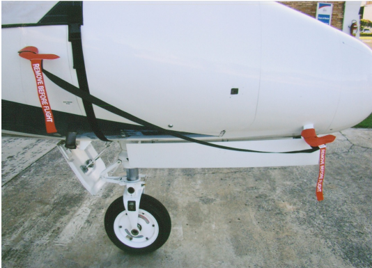
Citation XL Pitot Covers

The Engine Inlet Plugs are custom fit for your Cessna Citation VII (650) intakes, made with heavy-duty vinyl material, and stuffed with a single block of sculpted urethane foam. Each plug has a zipper that allows the foam to be removed and dried if necessary. Engine plugs have 'remove before flight' streamers sewn onto the face of the plugs. Most plugs are imprinted with the aircraft registration number in black for an extra charge. Storage bag NOT included. Engine plugs may be inserted after flight when the engine is still warm. Engine Inlet Plugs are commonly referred to as Cowl Plugs, Intake Plugs, Cowl Blocks, Engine Blocks, and Engine Bungs.