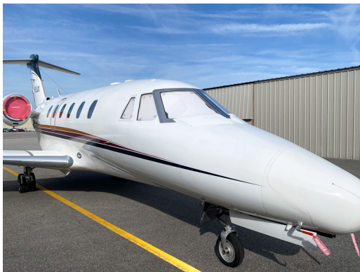
Cessna 650 Cockpit Heatshields (set of 6)

Cockpit Heatshields are interior sunshades for the aircraft's cockpit. The product is a unique composite of closed-cell foam with a silver mylar finish. The semi-rigid design is stiff enough to stand inside the window framing. The set folds up flat and is easily stored in the included storage sleeve. Some designs may require velcro and suction cups. Our Heatshields for jets are offered white side out because some aircraft manufacturers have issued advisories against reflective window inserts due to potential heat damage. A Heatshield is an excellent short-term remedy for cockpit overheating, but an external fabric cover is more effective for long-term protection.