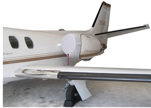
Citation XL Cockpit Cover & Bikini Type Engine Cover Cessna Citation "Bikini" Type Engine Covers: Extremely Light & Portable