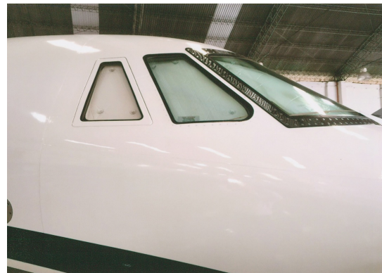
Citation XL Cockpit HeatShields