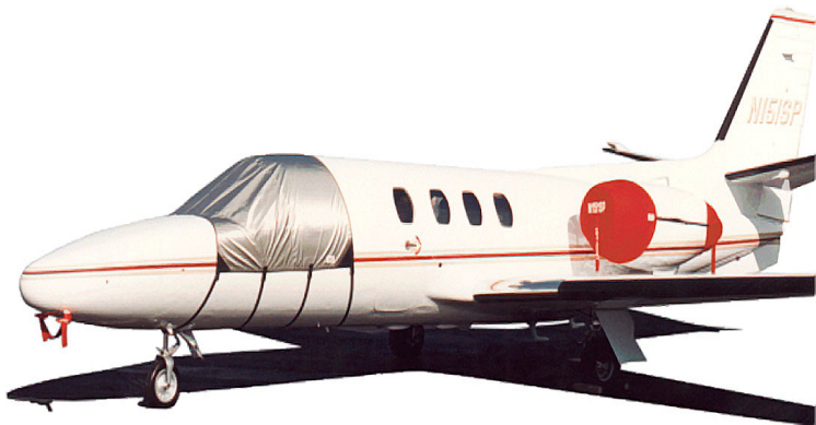
Cessna Citation I Windshield, Pitot and Engine Covers