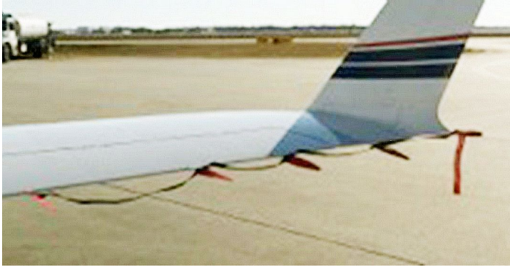
Static Wick Covers

dried if necessary. Engine plugs have 'remove before flight' streamers sewn onto the face of the plugs. Most plugs are imprinted with the aircraft registration number in black for an extra charge. Storage bag NOT included. Engine plugs may be inserted after flight when the engine is still warm. Engine Inlet Plugs are commonly referred to as Cowl Plugs, Intake Plugs, Cowl Blocks, Engine Blocks, and Engine Bungs.