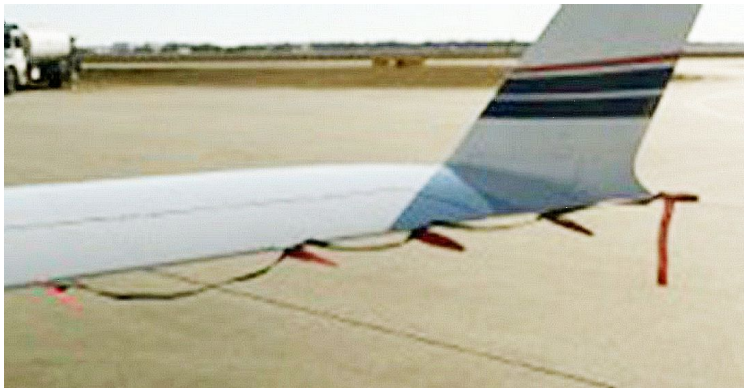
Static Wick Covers

with the aircraft registration number in black for an extra charge. Storage bag NOT included. Engine plugs may be inserted after flight when the engine is still warm. Engine Inlet Plugs are commonly referred to as Cowl Plugs, Intake Plugs, Cowl Blocks, Engine Blocks, and Engine Bungs.