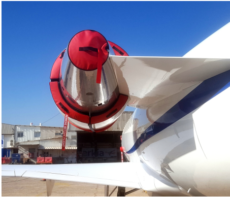
Canadair Challenger 604, 605, 650, 850 Exhaust Plugs

with the aircraft registration number in black for an extra charge. Storage bag NOT included. Engine plugs may be inserted after flight when the engine is still warm. Engine Inlet Plugs are commonly referred to as Cowl Plugs, Intake Plugs, Cowl Blocks, Engine Blocks, and Engine Bungs.