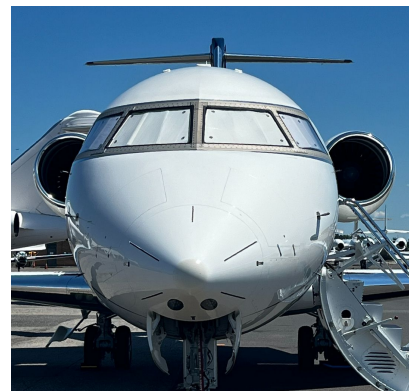
Bombardier CL-600-2B16 Cockpit Heatshields