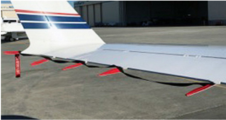
Static Wick Covers