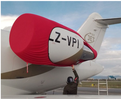
Challenger 605 Engine Covers, Bikini Type