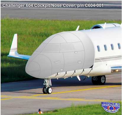
Challenger 601/604 Cockpit/Nose Cover, illustration

This cover type is made from Silver Acrylic Sunbrella canvas and is 100% lined with a soft and smooth microfiber. Bruce's Custom Covers developed this material combination especially for aircraft protection. The outer material is medium weight and treated for water resistance, UV resistance and anti-static buildup. The inner lining is a very soft and smooth microfiber to prevent scratching. The material is very reflective, and tests show that the cabin interior temperature can be reduced to near-ambient temperature on the hottest of days. It is water, ice and snow repellent, yet breathable to allow moisture to escape from between the cover and the aircraft surface.