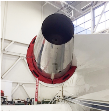
Canadair Challenger 604 Bypass Plugs