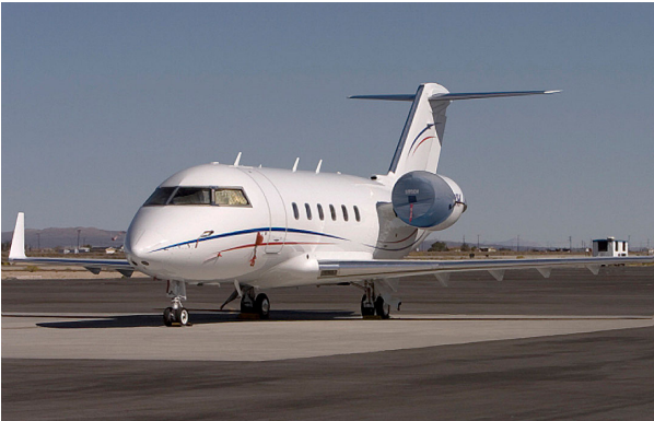
Challenger 604 Intake Covers, standard design