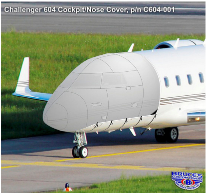
Challenger 601/604 Cockpit/Nose Cover, illustration

This cover type is made from Silver Acrylic Sunbrella canvas and is 100% lined with a soft and smooth microfiber. Bruce's Custom Covers developed this material combination especially for aircraft protection. The outer material is medium weight and treated for water resistance, UV resistance and anti-static buildup. The inner lining is a very soft and smooth microfiber to prevent scratching. The material is very reflective, and tests show that the cabin interior temperature can be reduced to near-ambient temperature on the hottest of days. It is water, ice and snow repellent, yet breathable to allow moisture to escape from between the cover and the aircraft surface.