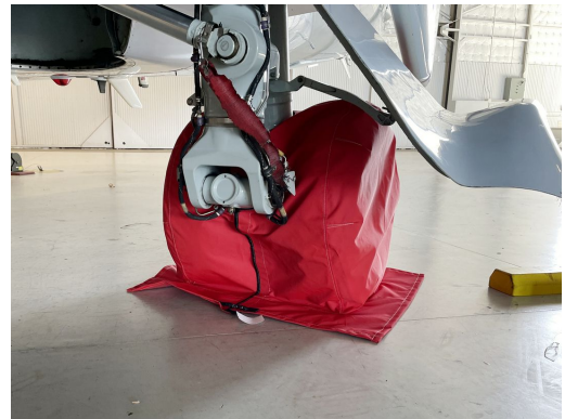
Canadair Challenger 605 Main Gear Tire Covers