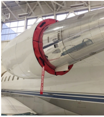
Canadair Challenger 604 Bypass Plugs