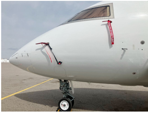
Challenger 650 Pitot & Ice Detector Covers