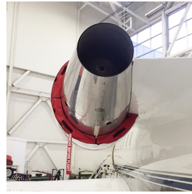
Canadair Challenger 604 Bypass Plugs