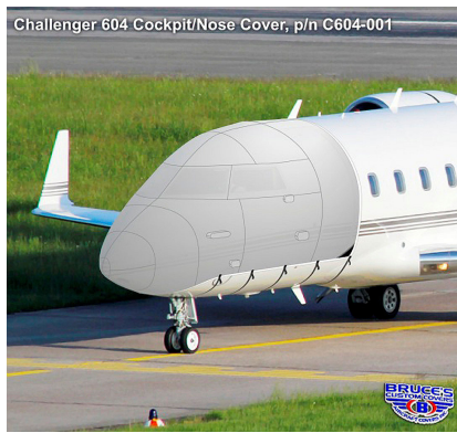
Challenger 601/604 Cockpit/Nose Cover, illustration