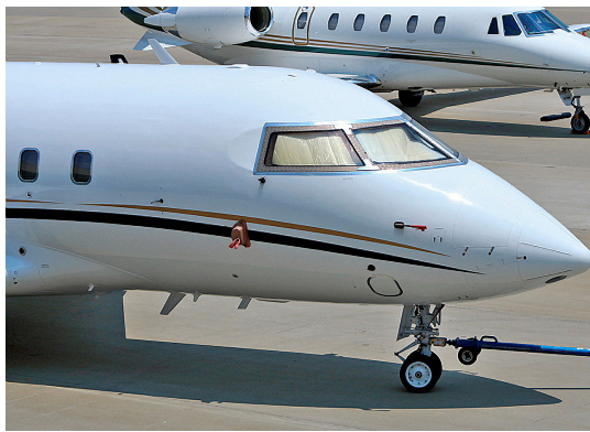
Challenger 604 Cockpit HeatShields