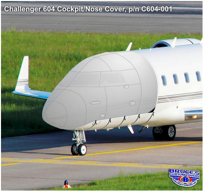
Challenger 601/604 Cockpit/Nose Cover, illustration

the hottest of days. It is water, ice and snow repellent, yet breathable to allow moisture to escape from between the cover and the aircraft surface.