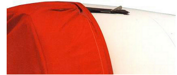
Alternate Intake Cover Design