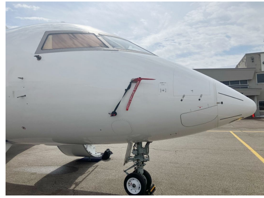
Challenger 650 Pitot & Ice Detector Covers