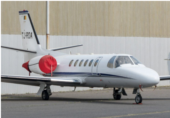
Cessna Citation II Bravo Engine Covers