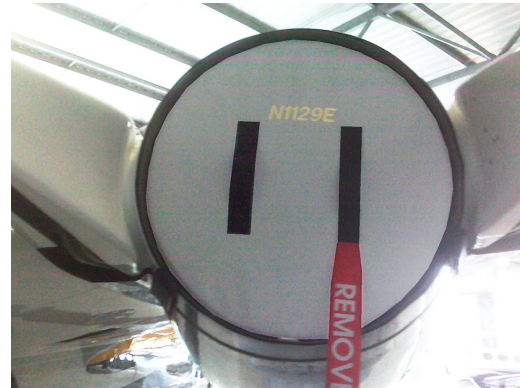
Citation XLS Exhaust Plugs