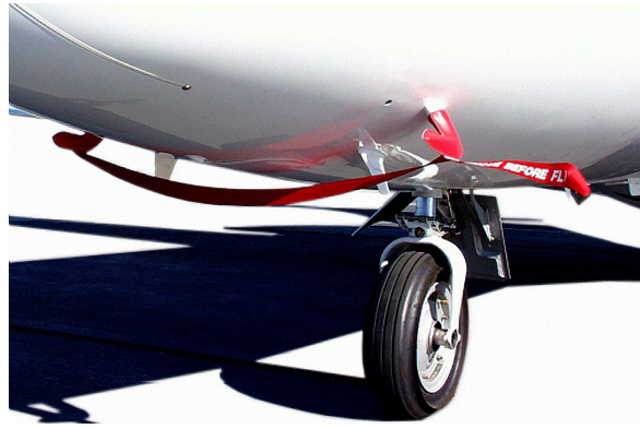
Cessna Citation I Pitot Covers