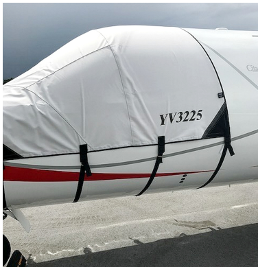
Cessna Citationjet V Ultra (560) Cockpit Cover

This cover type is made from Silver Acrylic Sunbrella canvas and is 100% lined with a soft and smooth microfiber. Bruce's Custom Covers developed this material combination especially for aircraft protection. The outer material is medium weight and treated for water resistance, UV resistance and anti-static buildup. The inner lining is a very soft and smooth microfiber to prevent scratching. The material is very reflective, and tests show that the cabin interior temperature can be reduced to near-ambient temperature on the hottest of days. It is water, ice and snow repellent, yet breathable to allow moisture to escape from between the cover and the aircraft surface.