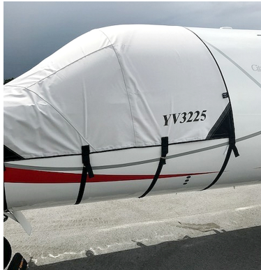
Cessna Citationjet V Ultra (560) Cockpit Cover

This cover type is made from Silver Acrylic Sunbrella canvas and is 100% lined with a soft and smooth microfiber. Bruce's Custom Covers developed this material combination especially for aircraft protection. The outer material is medium weight and treated for water resistance, UV resistance and anti-static buildup. The inner lining is a very soft and smooth microfiber to prevent scratching. The material is very reflective, and tests show that the cabin interior temperature can be reduced to near-ambient temperature on the hottest of days. It is water, ice and snow repellent, yet breathable to allow moisture to escape from between the cover and the aircraft surface.