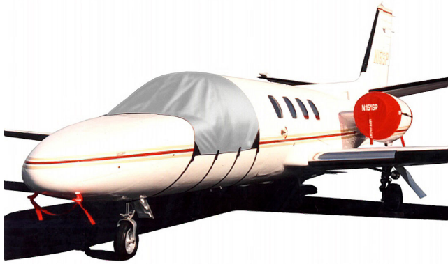
Cessna Citation Windshield Cover, Engine Cover set and Pitot Covers

This cover type is made from Silver Acrylic Sunbrella canvas and is 100% lined with a soft and smooth microfiber. Bruce's Custom Covers developed this material combination especially for aircraft protection. The outer material is medium weight and treated for water resistance, UV resistance and anti-static buildup. The inner lining is a very soft and smooth microfiber to prevent scratching. The material is very reflective, and tests show that the cabin interior temperature can be reduced to near-ambient temperature on the hottest of days. It is water, ice and snow repellent, yet breathable to allow moisture to escape from between the cover and the aircraft surface.