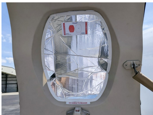
Citationjet Entrance Door Heatshield

Custom-made Heatshield Sunshades are available for almost any window in the jet. Side windows, Skylights, and Emergency Exits are all custom-made. The product is a unique composite of closed-cell foam with a silver mylar finish. The set is easily stored in the included storage sleeve. Some designs may require velcro and suction cups. Our Heatshields are offered white side out since aircraft manufacturers have issued advisories against reflective window inserts due to potential heat damage.