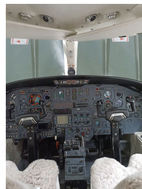
Cessna Citation I & II Cockpit HeatShields