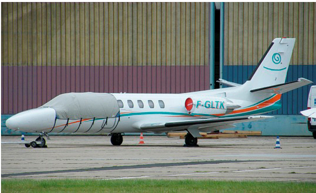
Citation Windshield Cover, to back of door