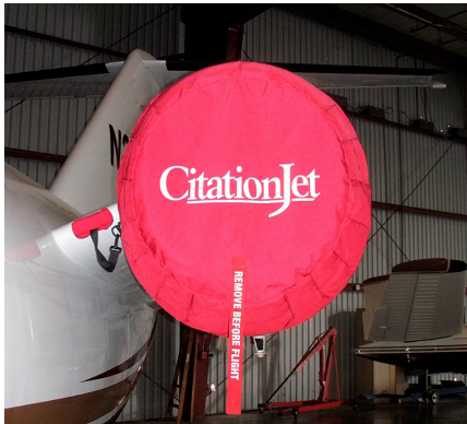
Cessna Citation Engine Cover Set

The Cessna Citation II Bravo Intake/Exhaust Plugs are custom fit for the intake and exhaust openings, made with heavy-duty vinyl material, and stuffed with a single block of sculpted urethane foam. Each plug has a zipper that allows the foam to be removed and dried if necessary. Engine plugs have 'remove before flight' streamers sewn onto the face of the plugs. Most plugs are imprinted with the aircraft registration number in black. Engine plugs may be inserted after flight when the engine is still warm. Engine Inlet Plugs are commonly referred to as Cowl Plugs, Intake Plugs, Cowl Blocks, Engine Blocks, and Engine Bungs.