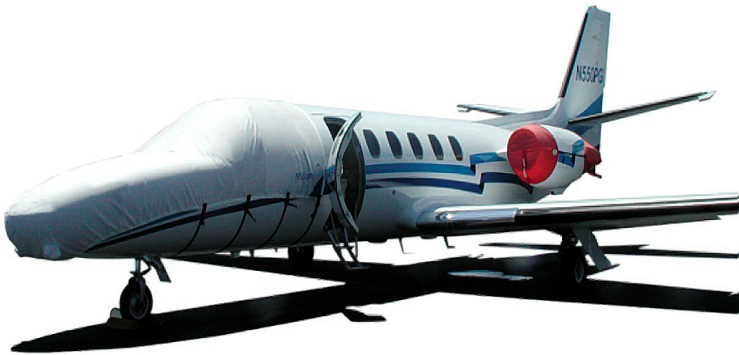
Cessna Citation Nose/Cockpit Cover, Engine Covers

This cover type is made from Silver Acrylic Sunbrella canvas and is 100% lined with a soft and smooth microfiber. Bruce's Custom Covers developed this material combination especially for aircraft protection. The outer material is medium weight and treated for water resistance, UV resistance and anti-static buildup. The inner lining is a very soft and smooth microfiber to prevent scratching. The material is very reflective, and tests show that the cabin interior temperature can be reduced to near-ambient temperature on the hottest of days. It is water, ice and snow repellent, yet breathable to allow moisture to escape from between the cover and the aircraft surface.