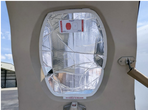
Citationjet Entrance Door Heatshield