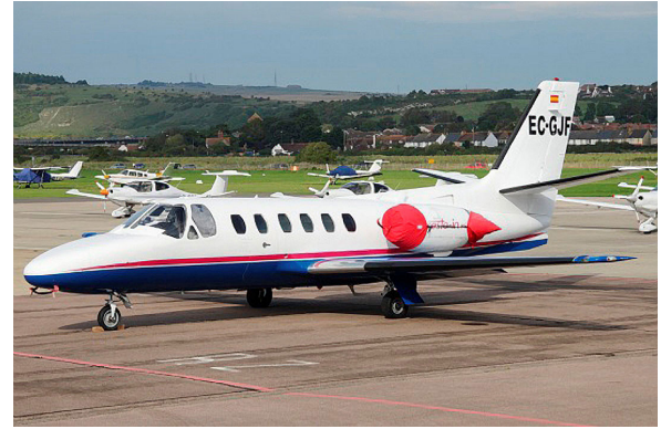
Cessna Citation II Engine Covers, Pitot Covers