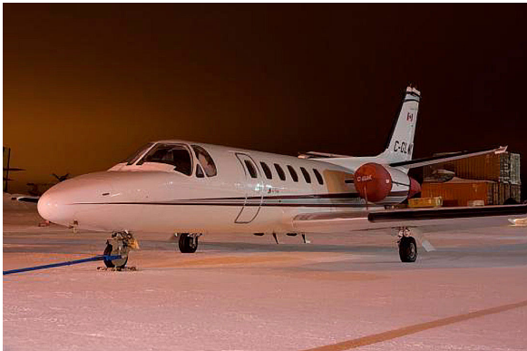
Cessna Citation 550 Engine Cover Set

The Cessna Citationjet V Ultra & Encore Models Intake/Exhaust Plugs are custom fit for the intake and exhaust openings, made with heavy-duty vinyl material, and stuffed with a single block of sculpted urethane foam. Each plug has a zipper that allows the foam to be removed and dried if necessary. Engine plugs have 'remove before flight' streamers sewn onto the face of the plugs. Most plugs are imprinted with the aircraft registration number in black. Engine plugs may be inserted after flight when the engine is still warm. Engine Inlet Plugs are commonly referred to as Cowl Plugs, Intake Plugs, Cowl Blocks, Engine Blocks, and Engine Bungs.