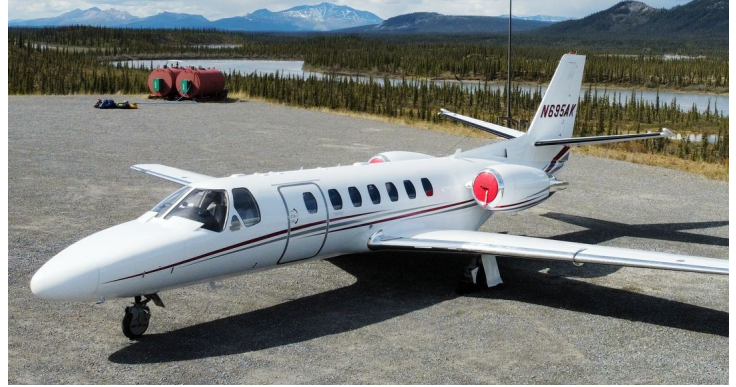
Hawker Beechcraft 800, 800XP, 850XP Static Wick Protectors Cessna Citationjet V Ultra (560) Intake Plugs, With Pylon Plugs