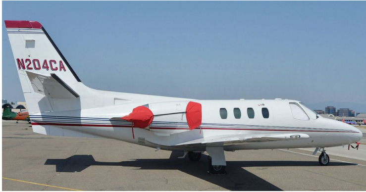
Cessna Citation Engine Covers and Heatshields

The Cessna Citationjet V Ultra & Encore Models Intake/Exhaust Plugs are custom fit for the intake and exhaust openings, made with heavy-duty vinyl material, and stuffed with a single block of sculpted urethane foam. Each plug has a zipper that allows the foam to be removed and dried if necessary. Engine plugs have 'remove before flight' streamers sewn onto the face of the plugs. Most plugs are imprinted with the aircraft registration number in black. Engine plugs may be inserted after flight when the engine is still warm. Engine Inlet Plugs are commonly referred to as Cowl Plugs, Intake Plugs, Cowl Blocks, Engine Blocks, and Engine Bungs.