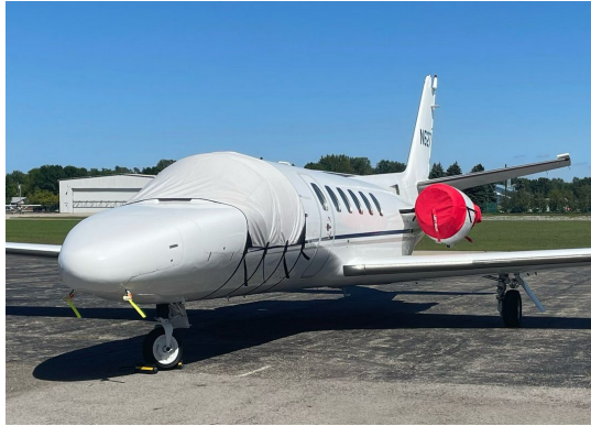
Cessna 550 Citation II

The Cessna Citation II (550, 551, UC-35A, with JT15D) Intake Covers are designed to install easily yet be completely storable. A spring steel hoop is sewn into the hem of each cover, allowing them to be installed without climbing onto the wing or using a stepladder. To store the covers the spring steel hoop folds like a band-saw blade into three nesting rings. Each cover folds into a compact circular bundle which is stored in the included duffel bag, yet they unfold quickly for use. The Tri-Fold Ring cover is made of medium weight nylon which is available in a variety of colors to match the paint trim. Each cover set comes complete with installation and folding instructions. The aircraft's registration number can be silkscreened onto the cover for an extra charge.