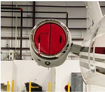
Embraer Legacy 500 Engine Inlet Plugs, folding type

The Engine Inlet Plugs are custom fit for your Cessna Citation II (550, 551, UC-35A, with JT15D) intakes, made with heavy-duty vinyl material, and stuffed with a single block of sculpted urethane foam. Each plug has a zipper that allows the foam to be removed and dried if necessary. Engine plugs have 'remove before flight' streamers sewn onto the face of the plugs. Most plugs are imprinted with the aircraft registration number in black for an extra charge. Storage bag NOT included. Engine plugs may be inserted after flight when the engine is still warm. Engine Inlet Plugs are commonly referred to as Cowl Plugs, Intake Plugs, Cowl Blocks, Engine Blocks, and Engine Bungs.