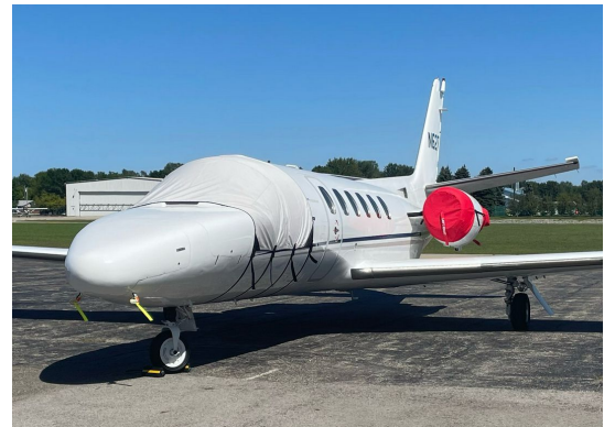
Cessna 550 Citation II