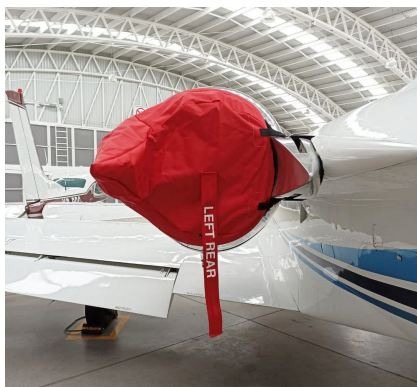
Cessna 551 Citation II SP Engine covers (with thrust reversers, smooth gen. inlet)

The Cessna Citation II (550, 551, UC-35A, with JT15D) Intake Covers are designed to install easily yet be completely storable. A spring steel hoop is sewn into the hem of each cover, allowing them to be installed without climbing onto the wing or using a stepladder. To store the covers the spring steel hoop folds like a band-saw blade into three nesting rings. Each cover folds into a compact circular bundle which is stored in the included duffle bag, yet they unfold quickly for use. The Tri-Fold Ring cover is made of medium weight nylon which is available in a variety of colors to match the paint trim. Each cover set comes complete with installation and folding instructions. The aircraft's registration number can be silkscreened onto the cover for an extra charge.