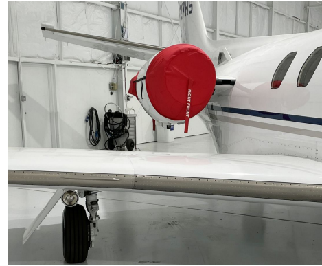
Cessna Citation S550 Intake/Exhaust Covers