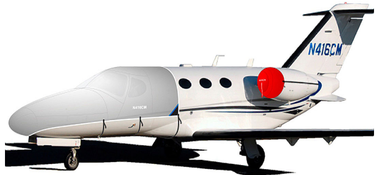
Citation Mustang Windshield Cover, Intake Cover/Exhaust Plug Set, Pitot Covers