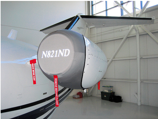
Citation Mustang Intake/Exhaust Cover, "Bikini" Type and leading edge Pylon inlet plugs

The Engine Inlet Plugs are custom fit for your Cessna Mustang 510 intakes, made with heavy-duty vinyl material, and stuffed with a single block of sculpted urethane foam. Each plug has a zipper that allows the foam to be removed and dried if necessary. Engine plugs have 'remove before flight' streamers sewn onto the face of the plugs. Most plugs are imprinted with the aircraft registration number in black for an extra charge. Storage bag NOT included. Engine plugs may be inserted after flight when the engine is still warm. Engine Inlet Plugs are commonly referred to as Cowl Plugs, Intake Plugs, Cowl Blocks, Engine Blocks, and Engine Bungs.