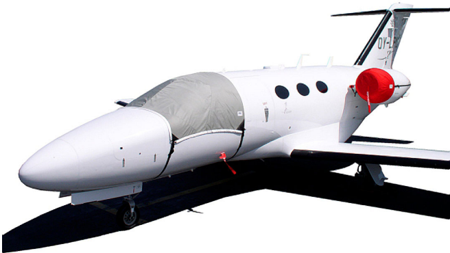
Citation Mustang Windshield Cover, Intake Cover/Exhaust Plug Set, Pitot Covers