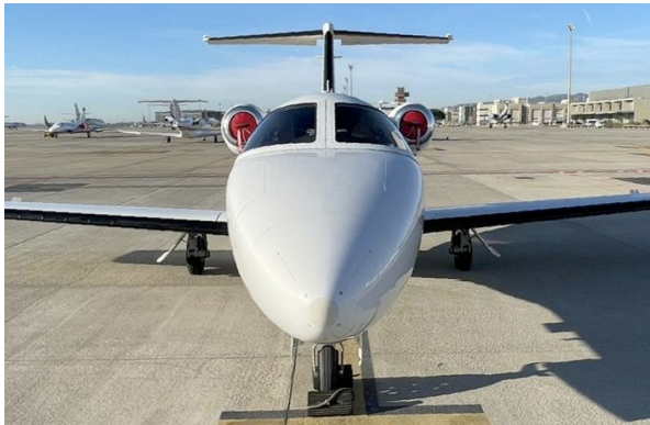
Cessna Mustang Engine Inlet Plugs