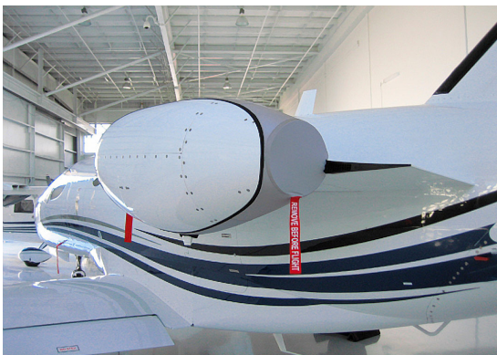
Citation Mustang Intake/Exhaust Cover, "Bikini" Type and leading edge Pylon inlet plugs

The Cessna Mustang 510 Intake/Exhaust Plugs are custom fit for the intake and exhaust openings, made with heavy-duty vinyl material, and stuffed with a single block of sculpted urethane foam. Each plug has a zipper that allows the foam to be removed and dried if necessary. Engine plugs have 'remove before flight' streamers sewn onto the face of the plugs. Most plugs are imprinted with the aircraft registration number in black. Engine plugs may be inserted after flight when the engine is still warm. Engine Inlet Plugs are commonly referred to as Cowl Plugs, Intake Plugs, Cowl Blocks, Engine Blocks, and Engine Bungs.