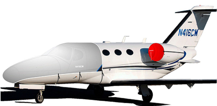
Citation Mustang Cockpit/Door/Nose Cover, Engine Inlet Cover

This cover type is made from Silver Acrylic Sunbrella canvas and is 100% lined with a soft and smooth microfiber. Bruce's Custom Covers developed this material combination especially for aircraft protection. The outer material is medium weight and treated for water resistance, UV resistance and anti-static buildup. The inner lining is a very soft and smooth microfiber to prevent scratching. The material is very reflective, and tests show that the cabin interior temperature can be reduced to near-ambient temperature on the hottest of days. It is water, ice and snow repellent, yet breathable to allow moisture to escape from between the cover and the aircraft surface.