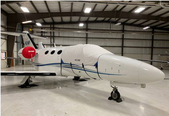
Cessna 510 Cockpit Cover extends to cover door