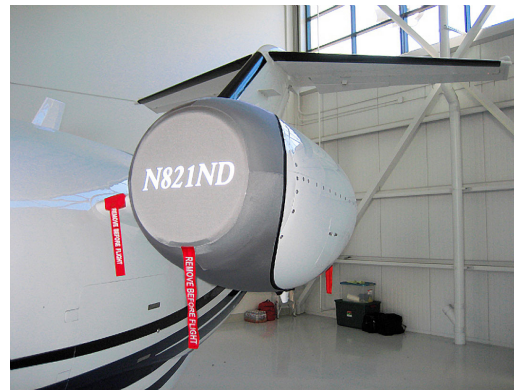
Citation Mustang Intake/Exhaust Cover, "Bikini" Type and leading edge Pylon inlet plugs