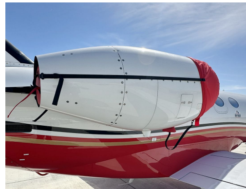
Cessna Citation Mustang 510 Intake Cover/Exhaust Plug Set