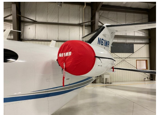
Cessna 510 Engine Inlet Covers & Exhaust Plugs