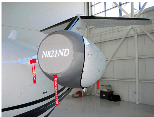
Citation Mustang Intake/Exhaust Cover, "Bikini" Type and leading edge Pylon inlet plugs

The Cessna Mustang 510 Intake/Exhaust Plugs are custom fit for the intake and exhaust openings, made with heavy-duty vinyl material, and stuffed with a single block of sculpted urethane foam. Each plug has a zipper that allows the foam to be removed and dried if necessary. Engine plugs have 'remove before flight' streamers sewn onto the face of the plugs. Most plugs are imprinted with the aircraft registration number in black. Engine plugs may be inserted after flight when the engine is still warm. Engine Inlet Plugs are commonly referred to as Cowl Plugs, Intake Plugs, Cowl Blocks, Engine Blocks, and Engine Bungs.