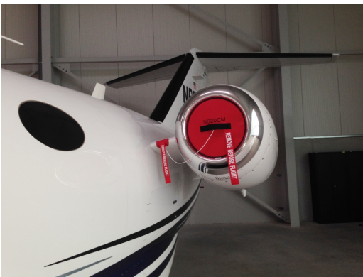
Citation Mustang Engine Intake Plugs

The Engine Inlet Plugs are custom fit for your Cessna Mustang 510 intakes, made with heavy-duty vinyl material, and stuffed with a single block of sculpted urethane foam. Each plug has a zipper that allows the foam to be removed and dried if necessary. Engine plugs have 'remove before flight' streamers sewn onto the face of the plugs. Most plugs are imprinted with the aircraft registration number in black for an extra charge. Storage bag NOT included. Engine plugs may be inserted after flight when the engine is still warm. Engine Inlet Plugs are commonly referred to as Cowl Plugs, Intake Plugs, Cowl Blocks, Engine Blocks, and Engine Bungs.