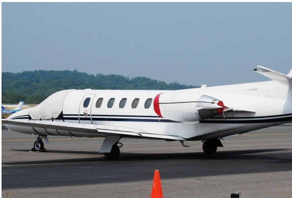
Cessna Citation S2 Cockpit Cover, Intake Covers & Exhaust Plugs