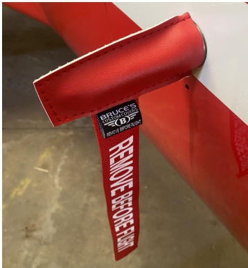
Cessna 501 Angle of Attack Transducer Cover