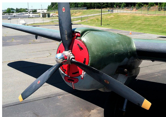
C-46 Radial Engine Intake Plug