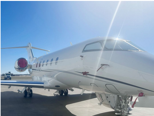
Canadair Challenger 300 Cockpit HeatShields, Intake Plugs