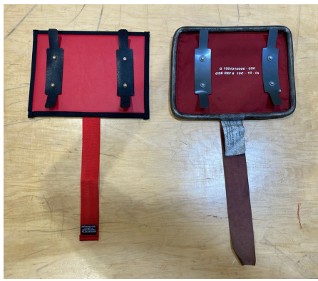
Canadair Challenger 300, 350 APU Intake Cover