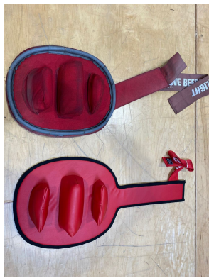
Canadair Challenger 300, 350 Heat Exchanger Exhaust Plug