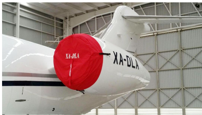
Challenger 300 Intake Covers