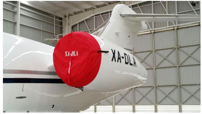
Intake/Exhaust Covers, 3-Strap Type. Successfully installed by two crew, one ladder.