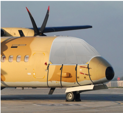
Casa C-295 Cockpit Cover (illustration)