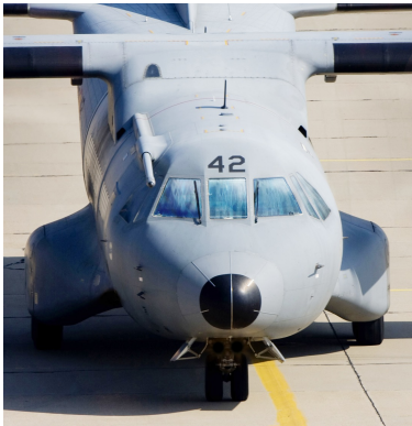
Casa C-295 Cockpit HeatShields (illustration)

This cover type is made from Silver Acrylic Sunbrella canvas and is 100% lined with a soft and smooth microfiber. Bruce's Custom Covers developed this material combination especially for aircraft protection. The outer material is medium weight and treated for water resistance, UV resistance and anti-static buildup. The inner lining is a very soft and smooth microfiber to prevent scratching. The material is very reflective, and tests show that the cabin interior temperature can be reduced to near-ambient temperature on the hottest of days. It is water, ice and snow repellent, yet breathable to allow moisture to escape from between the cover and the aircraft surface.