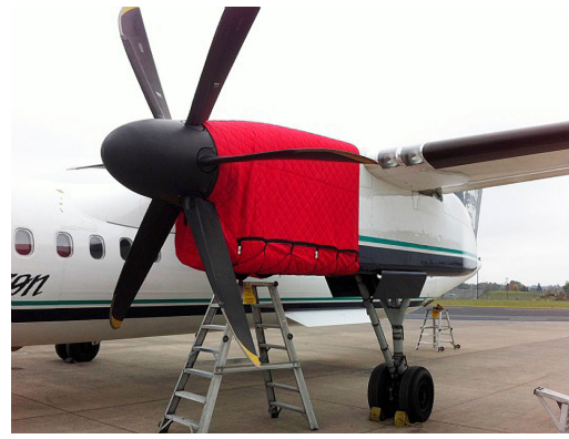
Dash 8-Q400 Insulated Engine Cover