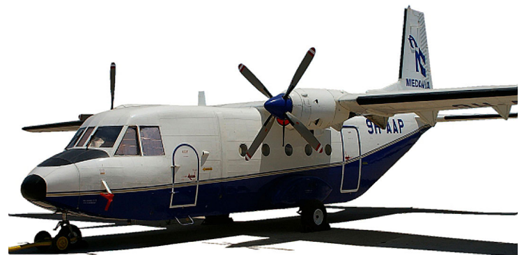
Casa 212 Engine Plugs