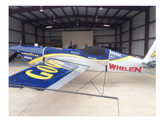
Mudry Cap 231 Canopy Cover