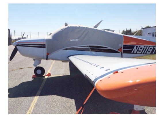
Beech Musketeer Canopy Cover

Travel Covers are made with Silver Solution-Dyed Polyester fabric and only lined over the windshield to save weight. The material is lightweight and more compact for easy stowage in the aircraft. The polyester material is water resistant, but only intended for occasional use outside. We also have an ultra lightweight material available for fitted hangar dust covers. For daily outdoor use, the non-travel Sunbrella Cover is the best choice.