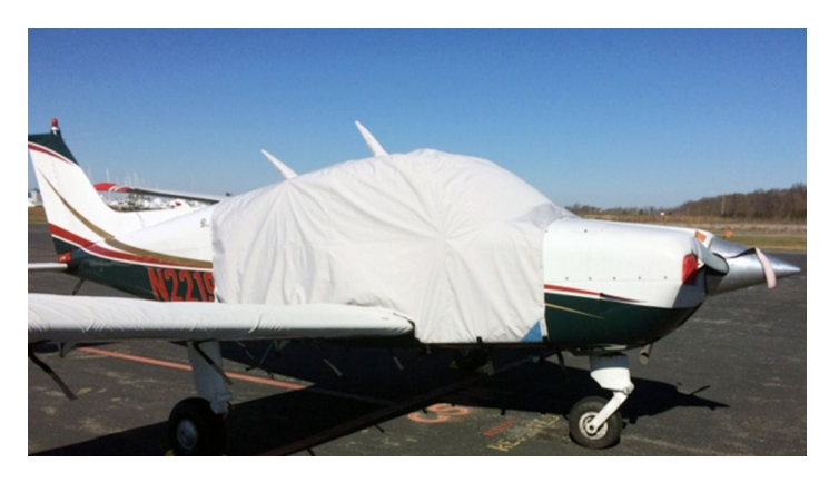
Beech Sundowner Extended Canopy Cover, Belly Strap Type