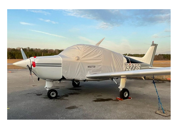
Beech Sundowner Extended Canopy Cover