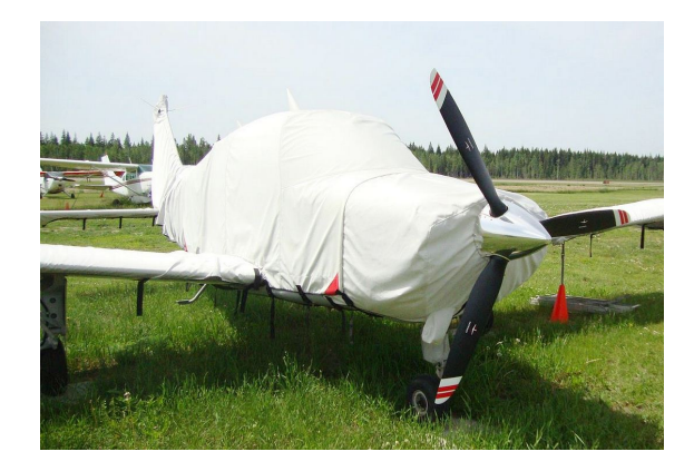
Beech Sierra Engine, Extended Canopy, Empennage, & Wing Covers