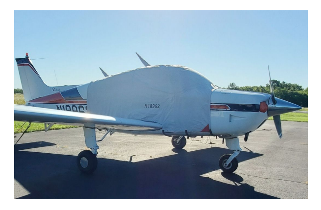
Beech C23 Sundowner Extended Canopy Cover

This cover type is made from Silver Acrylic Sunbrella canvas and is 100% lined with a soft and smooth microfiber. Bruce's Custom Covers developed this material combination especially for aircraft protection. The outer material is medium weight and treated for water resistance, UV resistance and anti-static buildup. The inner lining is a very soft and smooth microfiber to prevent scratching. The material is very reflective, and tests show that the cabin interior temperature can be reduced to near-ambient temperature on the hottest of days. It is water, ice and snow repellent, yet breathable to allow moisture to escape from between the cover and the aircraft surface.