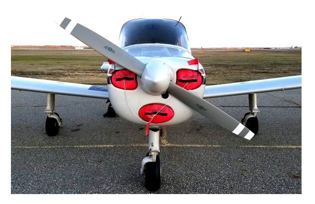
Beech Musketeer Engine Inlet Plugs

plugs have warning flags that are visible from the cockpit or 'remove before flight' streamers sewn onto the face of the plugs. Most plugs are imprinted with the aircraft registration number in black for an extra charge. Storage bag NOT included. Engine plugs may be inserted after flight when the engine is still warm. Engine Inlet Plugs are commonly referred to as Cowl Plugs, Intake Plugs, Cowl Blocks, Engine Blocks, and Engine Bungs.