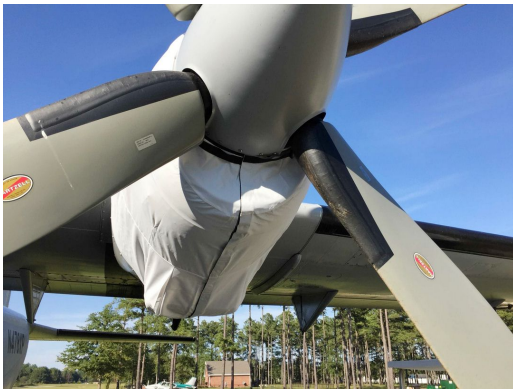
Casa 212 Engine Cover, test fit cover

This cover type is made from Silver Acrylic Sunbrella canvas and is 100% lined with a soft and smooth microfiber. Bruce's Custom Covers developed this material combination especially for aircraft protection. The outer material is medium weight and treated for water resistance, UV resistance and anti-static buildup. The inner lining is a very soft and smooth microfiber to prevent scratching. The material is very reflective, and tests show that the cabin interior temperature can be reduced to near-ambient temperature on the hottest of days. It is water, ice and snow repellent, yet breathable to allow moisture to escape from between the cover and the aircraft surface.