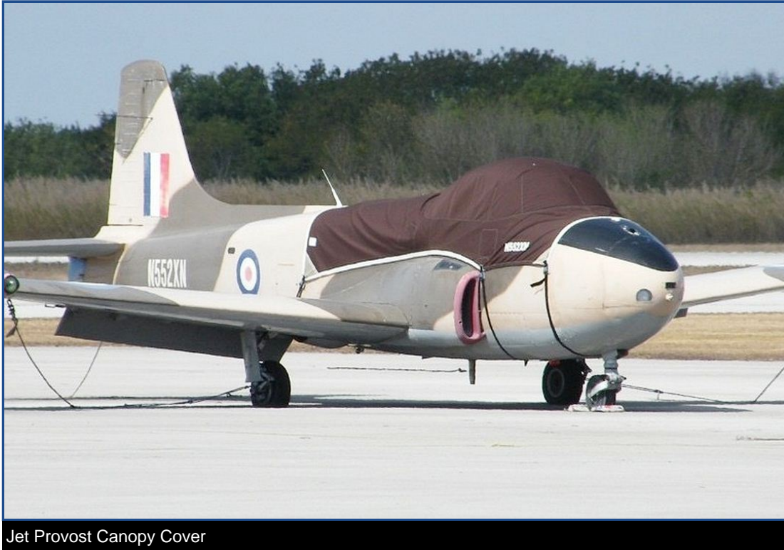
Jet Provost Canopy Cover