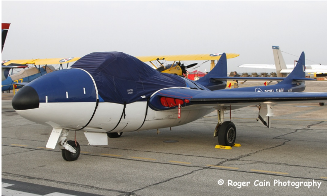
DeHavilland Vampire Canopy Cover, Engine Plugs

Travel Covers are made with Silver Solution-Dyed Polyester fabric and only lined over the windshield to save weight. The material is lightweight and more compact for easy stowage in the aircraft. The polyester material is water resistant, but only intended for occasional use outside. We also have an ultra lightweight material available for fitted hangar dust covers. For daily outdoor use, the non-travel Sunbrella Cover is the best choice.