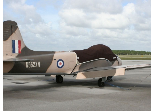
Jet Provost Canopy Cover