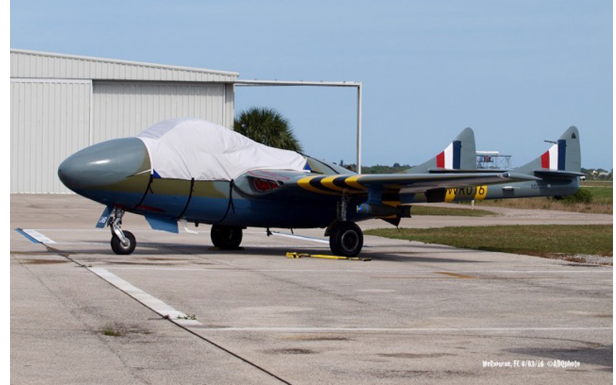
DeHavilland Vampire Canopy Cover