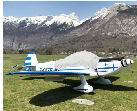
Mudry Cap 10 Canopy Cover