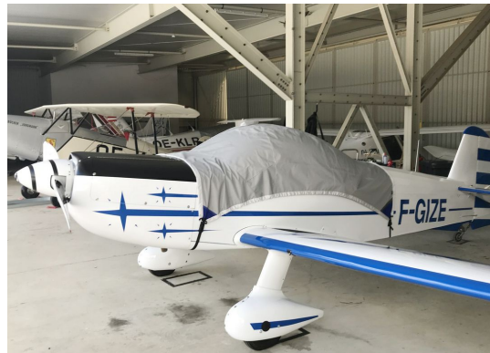
Mudry Cap 10 Travel Cover, Light Weight Travel Canopy Cover