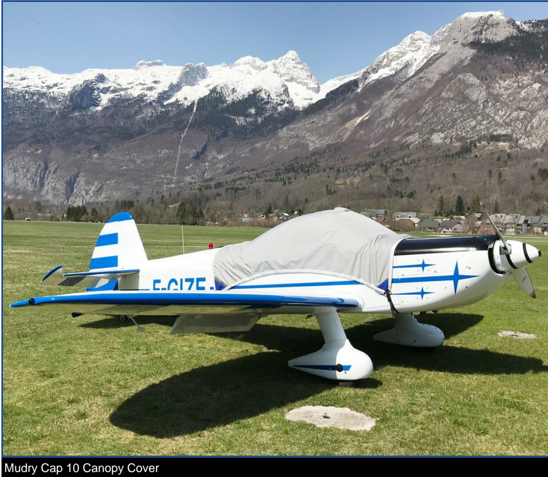
Mudry Cap 10 Canopy Cover