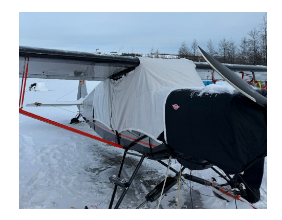
Bushmaster Canopy & Insulated Engine Covers

WINTER USE MATERIAL - Made with Solution-Dyed Polyester fabric, this option is intended for seasonal use to aid in deicing, rain mitigation, or for occasional travel. The material is lighter and more compact, but more susceptible to UV damage and may have a shorter useful life if used continuously outside than the all-year use material.