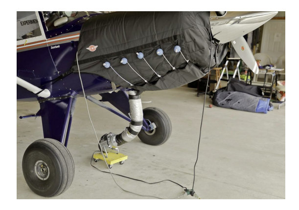
Bearhawk Insulated Engine Cover

This cover type is made from Silver Acrylic Sunbrella canvas and is 100% lined with a soft and smooth microfiber. Bruce's Custom Covers developed this material combination especially for aircraft protection. The outer material is medium weight and treated for water resistance, UV resistance and anti-static buildup. The inner lining is a very soft and smooth microfiber to prevent scratching. The material is very reflective, and tests show that the cabin interior temperature can be reduced to near-ambient temperature on the hottest of days. It is water, ice and snow repellent, yet breathable to allow moisture to escape from between the cover and the aircraft surface.