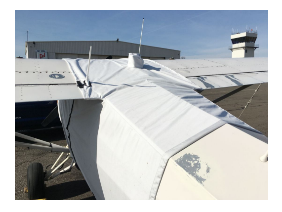
Maule M-5-235C Extended Canopy Cover