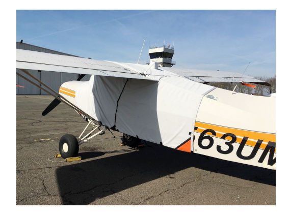
Maule M-5-235C Extended Canopy Cover

This cover type is made from Silver Acrylic Sunbrella canvas and is 100% lined with a soft and smooth microfiber. Bruce's Custom Covers developed this material combination especially for aircraft protection. The outer material is medium weight and treated for water resistance, UV resistance and anti-static buildup. The inner lining is a very soft and smooth microfiber to prevent scratching. The material is very reflective, and tests show that the cabin interior temperature can be reduced to near-ambient temperature on the hottest of days. It is water, ice and snow repellent, yet breathable to allow moisture to escape from between the cover and the aircraft surface.