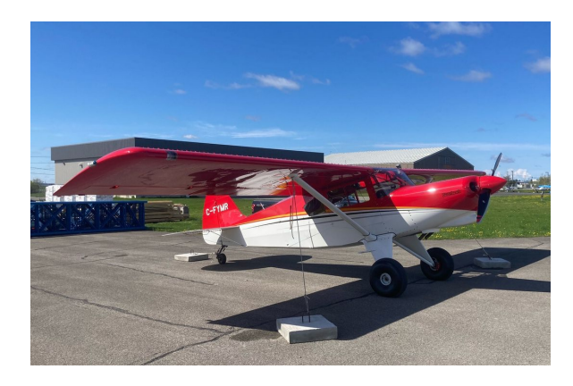
Bearhawk 4-Place Complete Cover Set, BEFORE