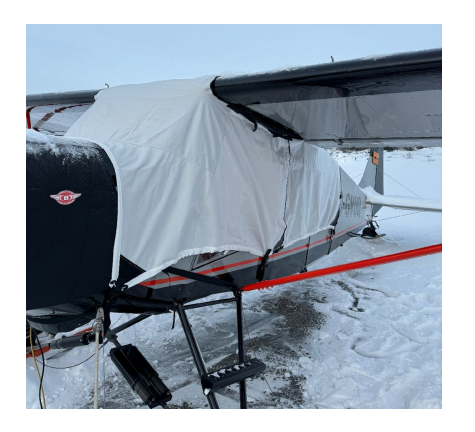
Bushmaster Canopy & Insulated Engine Covers