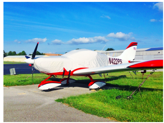
SportCruiser Canopy/Engine Cover