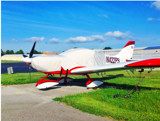
SportCruiser Canopy/Engine Cover