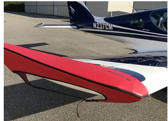
BRM Aero Bristell S-LSA Wingtip Pads