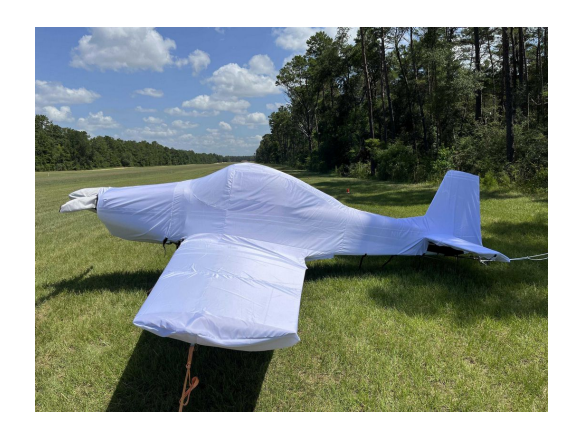
Thorp T-18 & Bushby Mustang Complete Cover, test fit cover

This cover type is made from Silver Acrylic Sunbrella canvas and is 100% lined with a soft and smooth microfiber. Bruce's Custom Covers developed this material combination especially for aircraft protection. The outer material is medium weight and treated for water resistance, UV resistance and anti-static buildup. The inner lining is a very soft and smooth microfiber to prevent scratching. The material is very reflective, and tests show that the cabin interior temperature can be reduced to near-ambient temperature on the hottest of days. It is water, ice and snow repellent, yet breathable to allow moisture to escape from between the cover and the aircraft surface.