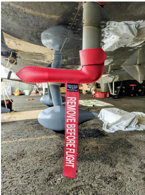
Van's RV-14 Pitot Cover

Engine Inlet Plugs are custom fit for your Bearhawk 4-Place & 5-Place Models intakes, made with heavy-duty vinyl material, and stuffed with a single block of sculpted urethane foam. Each plug has a zipper that allows the foam to be removed and dried if necessary. Engine plugs have warning flags that are visible from the cockpit or 'remove before flight' streamers sewn onto the face of the plugs. Most plugs are imprinted with the aircraft registration number in black for an extra charge. Storage bag NOT included. Engine plugs may be inserted after flight when the engine is still warm. Engine Inlet Plugs are commonly referred to as Cowl Plugs, Intake Plugs, Cowl Blocks, Engine Blocks, and Engine Bungs.