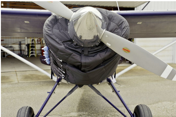
Bearhawk Insulated Engine Cover