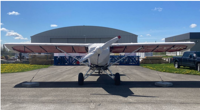
Bearhawk 4-Place Complete Cover Set

WINTER USE MATERIAL - Made with Solution-Dyed Polyester fabric, this option is intended for seasonal use to aid in deicing, rain mitigation, or for occasional travel. The material is lighter and more compact, but more susceptible to UV damage and may have a shorter useful life if used continuously outside than the all-year use material.