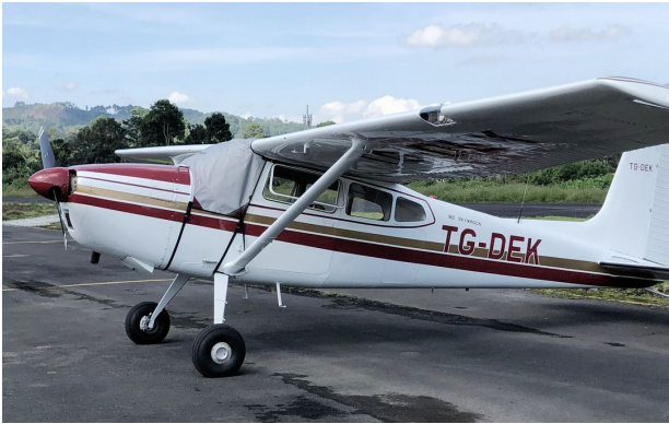
Cessna 180 Windshield Cover

This cover type is made from Silver Acrylic Sunbrella canvas and is 100% lined with a soft and smooth microfiber. Bruce's Custom Covers developed this material combination especially for aircraft protection. The outer material is medium weight and treated for water resistance, UV resistance and anti-static buildup. The inner lining is a very soft and smooth microfiber to prevent scratching. The material is very reflective, and tests show that the cabin interior temperature can be reduced to near-ambient temperature on the hottest of days. It is water, ice and snow repellent, yet breathable to allow moisture to escape from between the cover and the aircraft surface.