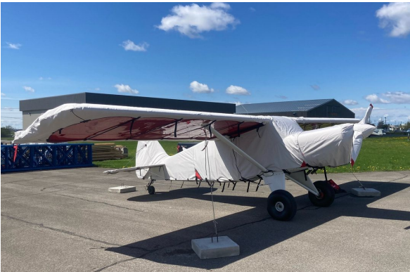
Bearhawk 4-Place Complete Cover Set, AFTER