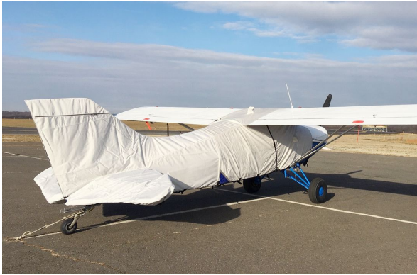
Maule M-5-235C Extended Canopy Cover, Empennage Cover