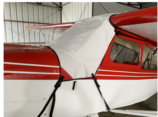
Bellanca Citabria Windshield/Skylight Cover