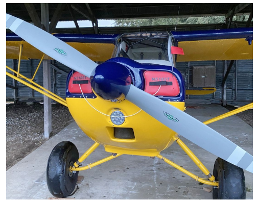
American Champion Engine Inlet Plugs