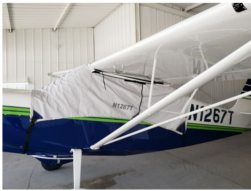
American Champion Aircraft 7GCBC Over-The-Top-Style Canopy Cover