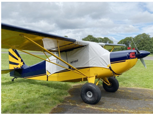
American Champion Citabria canopy cover over the top style, extends to cover gas caps, Engine Plugs