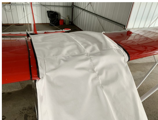
Bellanca Citabria Windshield/Skylight Cover

This cover type is made from Silver Acrylic Sunbrella canvas and is 100% lined with a soft and smooth microfiber. Bruce's Custom Covers developed this material combination especially for aircraft protection. The outer material is medium weight and treated for water resistance, UV resistance and anti-static buildup. The inner lining is a very soft and smooth microfiber to prevent scratching. The material is very reflective, and tests show that the cabin interior temperature can be reduced to near-ambient temperature on the hottest of days. It is water, ice and snow repellent, yet breathable to allow moisture to escape from between the cover and the aircraft surface.