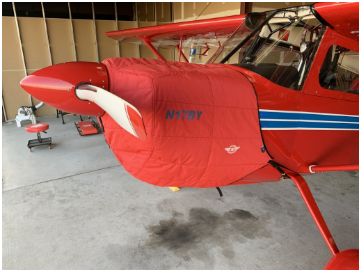
American Champion 8KCAB Insulated Engine Cover