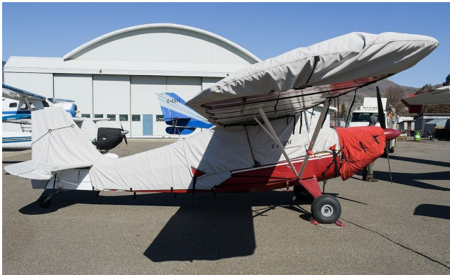
Bellanca Citabria 7ECA Canopy, Empennage & Wing Covers