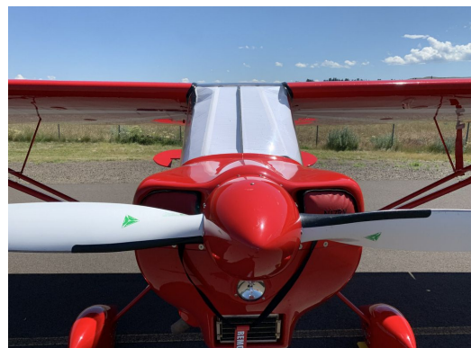
Bellanca Decathlon 8KCAB Heatshield Set with white side out