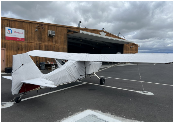
Bellanca Decathlon Full Cover Set

This cover type is made from Silver Acrylic Sunbrella canvas and is 100% lined with a soft and smooth microfiber. Bruce's Custom Covers developed this material combination especially for aircraft protection. The outer material is medium weight and treated for water resistance, UV resistance and anti-static buildup. The inner lining is a very soft and smooth microfiber to prevent scratching. The material is very reflective, and tests show that the cabin interior temperature can be reduced to near-ambient temperature on the hottest of days. It is water, ice and snow repellent, yet breathable to allow moisture to escape from between the cover and the aircraft surface.