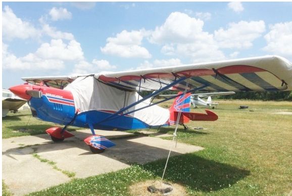
Bellanca Decathlon Canopy Cover (Over-Top, Extended to tail), Wing Covers, Engine Plugs

WINTER USE MATERIAL - Made with Solution-Dyed Polyester fabric, this option is intended for seasonal use to aid in deicing, rain mitigation, or for occasional travel. The material is lighter and more compact, but more susceptible to UV damage and may have a shorter useful life if used continuously outside than the all-year use material.