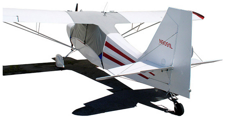
Bellanca Citabria Over-Top Canopy, extended to cover gas caps