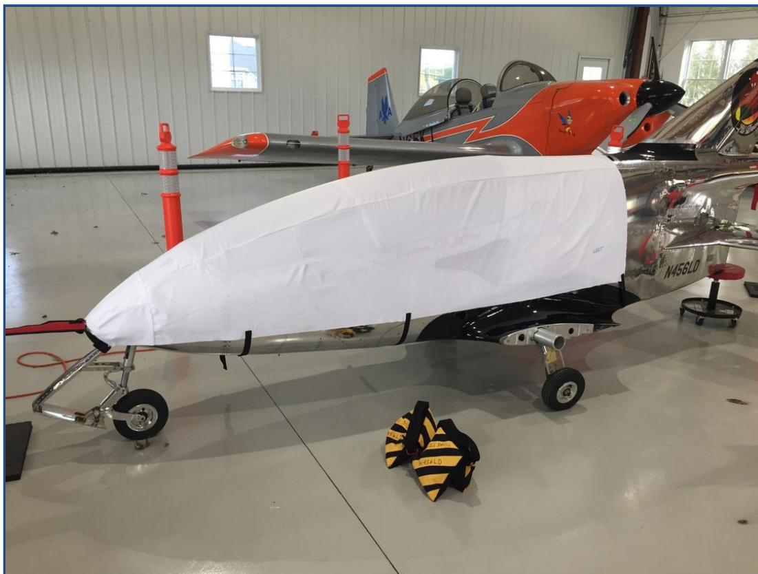
Bede BD-5 Canopy/Nose Cover, test fit cover