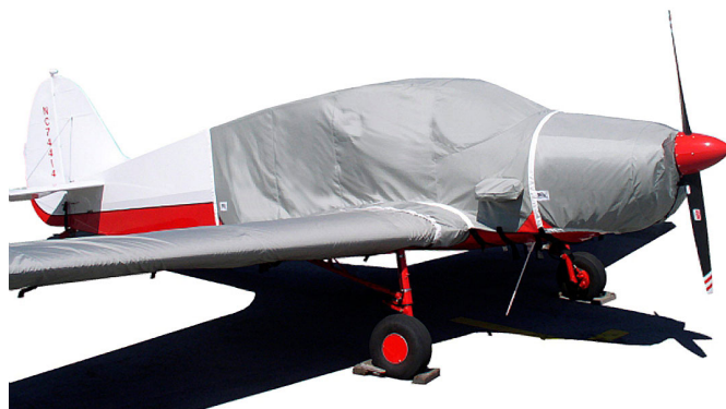
Bellanca Cruisemaster Insulated Engine Cover