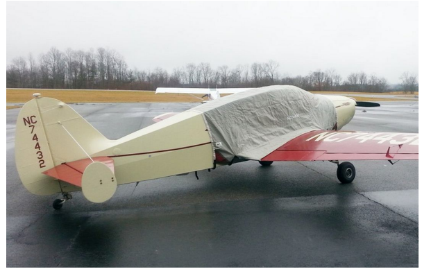
Bellanca Cruisemaster Extended Canopy Cover