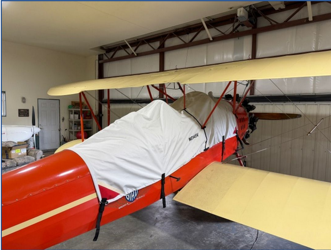
Perth Amboy Brunner Winkle Bird Canopy Cover