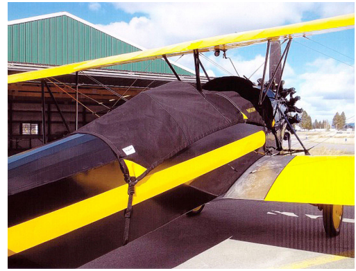
Stearman C3 Canopy Cover