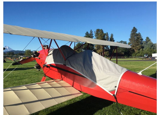
Bird BK Travel Canopy Cover