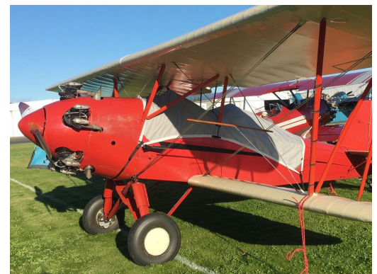
Bird BK Travel Canopy Cover