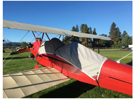
Bird BK Travel Canopy Cover