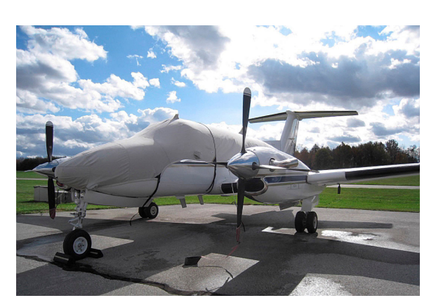
King Air B200 Canopy/Nose Cover