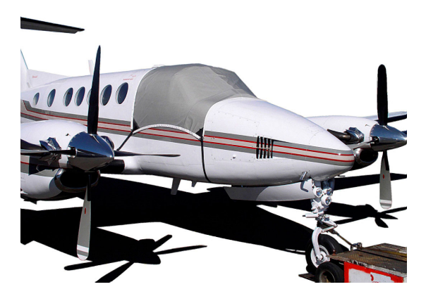
King Air 200/300 Snap-On Windshield Cover

This cover type is made from Silver Acrylic Sunbrella canvas and is 100% lined with a soft and smooth microfiber. Bruce's Custom Covers developed this material combination especially for aircraft protection. The outer material is medium weight and treated for water resistance, UV resistance and anti-static buildup. The inner lining is a very soft and smooth microfiber to prevent scratching. The material is very reflective, and tests show that the cabin interior temperature can be reduced to near-ambient temperature on the hottest of days. It is water, ice and snow repellent, yet breathable to allow moisture to escape from between the cover and the aircraft surface.