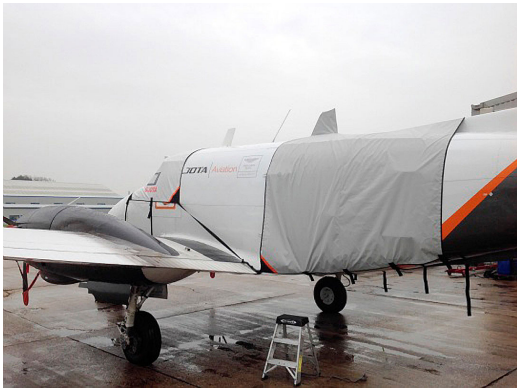
King Air Cargo/Jump Door Rain Cover