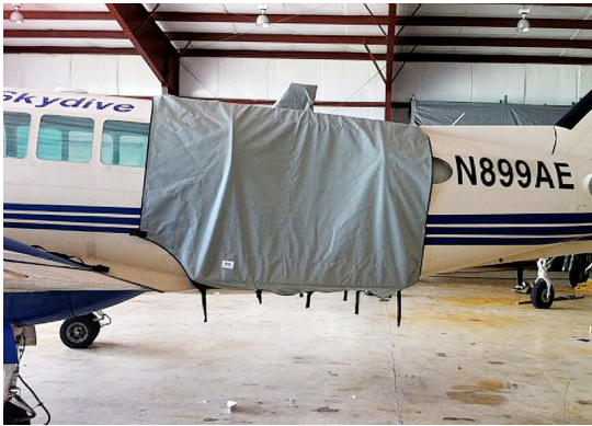
750XL Jump Door Cover