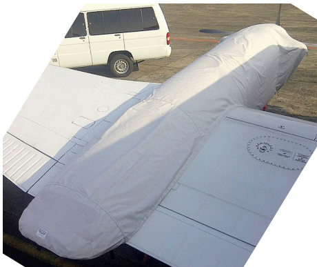
King Air 350 Engine Cover

This cover type is made from Silver Acrylic Sunbrella canvas and is 100% lined with a soft and smooth microfiber. Bruce's Custom Covers developed this material combination especially for aircraft protection. The outer material is medium weight and treated for water resistance, UV resistance and anti-static buildup. The inner lining is a very soft and smooth microfiber to prevent scratching. The material is very reflective, and tests show that the cabin interior temperature can be reduced to near-ambient temperature on the hottest of days. It is water, ice and snow repellent, yet breathable to allow moisture to escape from between the cover and the aircraft surface.