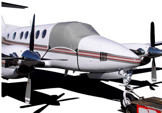
King Air 200/300 Snap-On Windshield Cover

This cover type is made from Silver Acrylic Sunbrella canvas and is 100% lined with a soft and smooth microfiber. Bruce's Custom Covers developed this material combination especially for aircraft protection. The outer material is medium weight and treated for water resistance, UV resistance and anti-static buildup. The inner lining is a very soft and smooth microfiber to prevent scratching. The material is very reflective, and tests show that the cabin interior temperature can be reduced to near-ambient temperature on the hottest of days. It is water, ice and snow repellent, yet breathable to allow moisture to escape from between the cover and the aircraft surface.