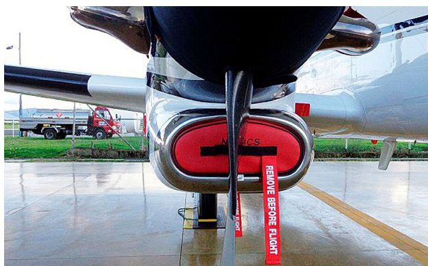
Beech King Air C90B Main Engine Inlet Plug

Engine Inlet Plugs are custom fit for your Beech 99 Airliner intakes, made with heavy-duty vinyl material, and stuffed with a single block of sculpted urethane foam. Each plug has a zipper that allows the foam to be removed and dried if necessary. Engine plugs have warning flags that are visible from the cockpit or 'remove before flight' streamers sewn onto the face of the plugs. Most plugs are imprinted with the aircraft registration number in black for an extra charge. Storage bag NOT included. Engine plugs may be inserted after flight when the engine is still warm. Engine Inlet Plugs are commonly referred to as Cowl Plugs, Intake Plugs, Cowl Blocks, Engine Blocks, and Engine Bungs.