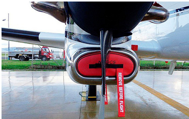
Beech King Air C90B Main Engine Inlet Plug

Engine Inlet Plugs are custom fit for your Beech 99 Airliner intakes, made with heavy-duty vinyl material, and stuffed with a single block of sculpted urethane foam. Each plug has a zipper that allows the foam to be removed and dried if necessary. Engine plugs have warning flags that are visible from the cockpit or 'remove before flight' streamers sewn onto the face of the plugs. Most plugs are imprinted with the aircraft registration number in black for an extra charge. Storage bag NOT included. Engine plugs may be inserted after flight when the engine is still warm. Engine Inlet Plugs are commonly referred to as Cowl Plugs, Intake Plugs, Cowl Blocks, Engine Blocks, and Engine Bungs.