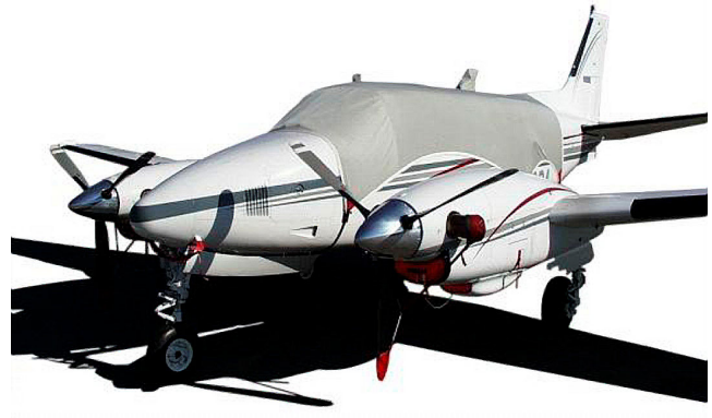
King Air Canopy Cover, Engine Plugs, Prop-Tie/Exhaust Covers