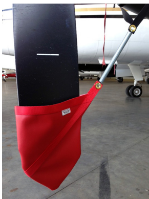
King Air Prop Tie

This cover type is made from Silver Acrylic Sunbrella canvas and is 100% lined with a soft and smooth microfiber. Bruce's Custom Covers developed this material combination especially for aircraft protection. The outer material is medium weight and treated for water resistance, UV resistance and anti-static buildup. The inner lining is a very soft and smooth microfiber to prevent scratching. The material is very reflective, and tests show that the cabin interior temperature can be reduced to near-ambient temperature on the hottest of days. It is water, ice and snow repellent, yet breathable to allow moisture to escape from between the cover and the aircraft surface.