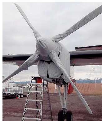
Dash 8 Insulated Engine & Prop Covers