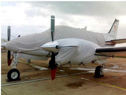
King Air C90 Canopy/Nose Cover, Engine Covers

This cover type is made from Silver Acrylic Sunbrella canvas and is 100% lined with a soft and smooth microfiber. Bruce's Custom Covers developed this material combination especially for aircraft protection. The outer material is medium weight and treated for water resistance, UV resistance and anti-static buildup. The inner lining is a very soft and smooth microfiber to prevent scratching. The material is very reflective, and tests show that the cabin interior temperature can be reduced to near-ambient temperature on the hottest of days. It is water, ice and snow repellent, yet breathable to allow moisture to escape from between the cover and the aircraft surface.