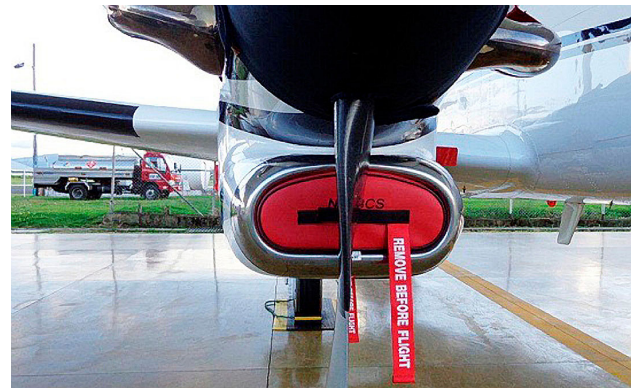
Beech King Air C90B Main Engine Inlet Plug