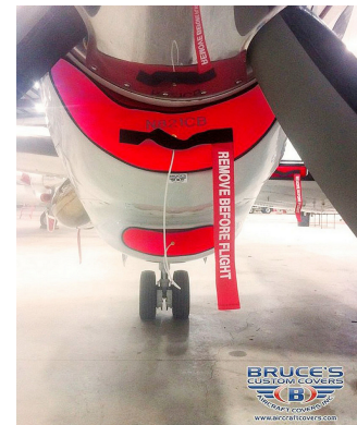
Engine and Oil Cooler Inlet Plugs