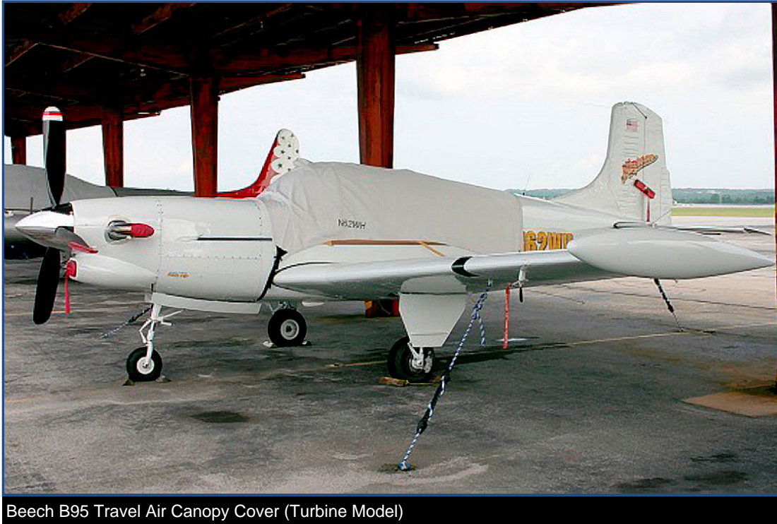
Beech B95 Travel Air Canopy Cover (Turbine Model)