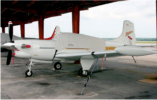
Beech B95 Travel Air Canopy Cover (Turbine Model)

Canopy Covers are commonly referred to as Cabin Covers, Fuselage Covers, Canvas Covers, Canopy Caps, etc.