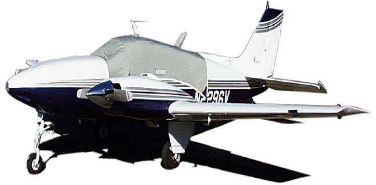
Beech Baron Canopy Cover