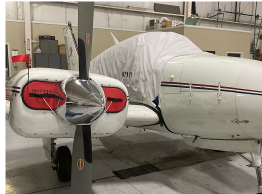
Beech Travel Air Engine Plugs