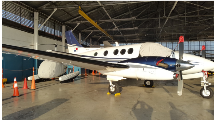
Raytheon Beech King Air Cockpit Cover, Prop Tie/Exhaust Covers, Inlet Plugs