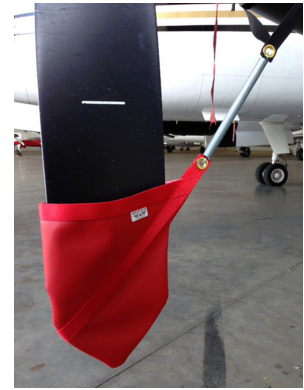
King Air Prop Tie