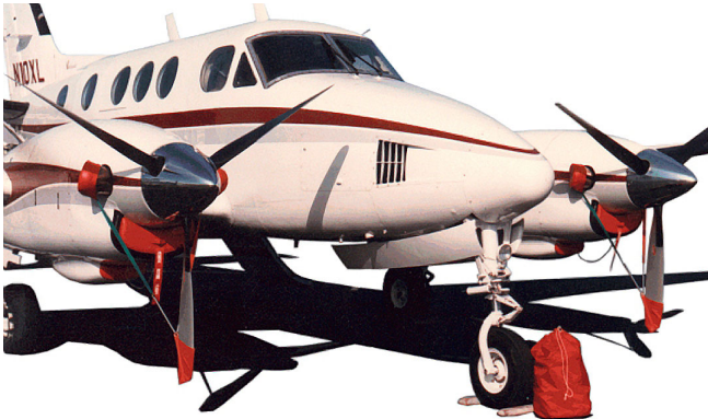
Pitot, Exhaust Covers, Engine Plugs &amp; Prop Ties

Engine Inlet Plugs are custom fit for your Beech King Air C90-1 intakes, made with heavy-duty vinyl material, and stuffed with a single block of sculpted urethane foam. Each plug has a zipper that allows the foam to be removed and dried if necessary. Engine plugs have warning flags that are visible from the cockpit or 'remove before flight' streamers sewn onto the face of the plugs. Most plugs are imprinted with the aircraft registration number in black for an extra charge. Storage bag NOT included. Engine plugs may be inserted after flight when the engine is still warm. Engine Inlet Plugs are commonly referred to as Cowl Plugs, Intake Plugs, Cowl Blocks, Engine Blocks, and Engine Bungs.