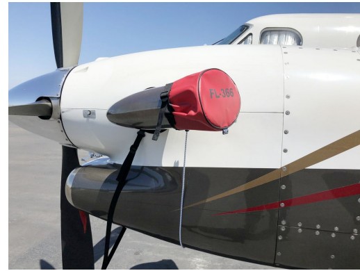
Beech King Air 350 Prop Tie-Downs/Exhaust Covers Combination