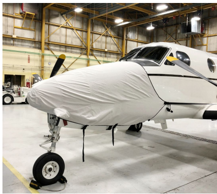
King Air 200 Nose Cover