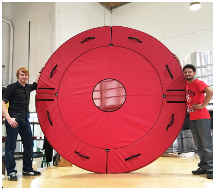
Boeing 787 Intake Plug, framed bi-fold type

The Engine Exhaust Plugs are custom fit for your Boeing 787 Dreamliner exhaust openings, made with heavy-duty vinyl material, and stuffed with a single block of sculpted urethane foam. Each plug has a zipper that allows the foam to be removed and dried if necessary. Exhaust plugs have 'remove before flight' streamers sewn onto the face of the plugs. Most plugs are imprinted with the aircraft registration number in black for an extra charge. Exhaust plugs may be inserted soon after flight when the engine is still warm. Engine Inlet Plugs are commonly referred to as Cowl Plugs, Intake Plugs, Cowl Blocks, Engine Blocks, and Engine Bungs.