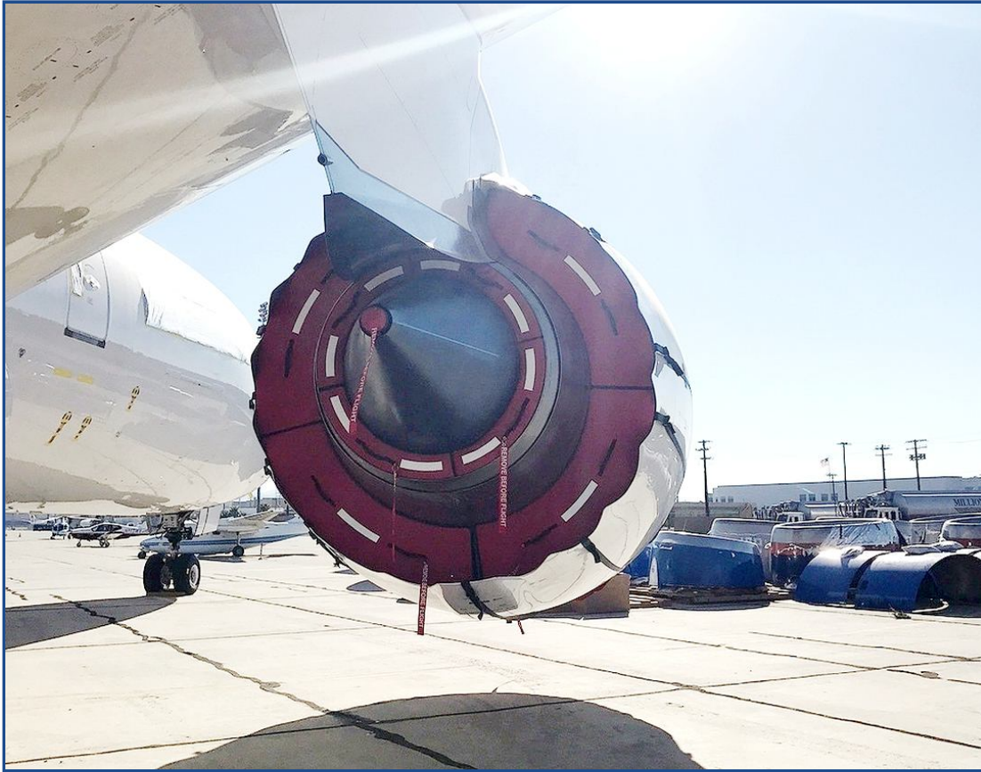
Boeing 787 Dreamliner Bypass Vent, Turbine Exhaust, & Exhaust Nozzle Plugs, Genx Engines