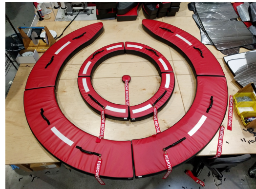
Boeing 747-8 Exhaust Plugs