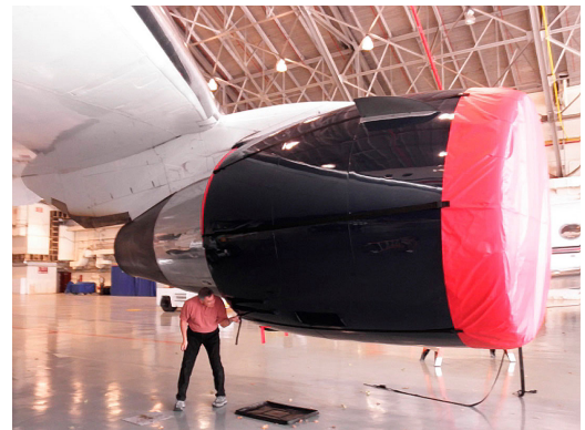
Boeing 767 Intake Covers Ship Set