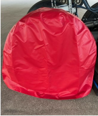
Boeing 777 Main Gear Tire Covers

ALL-YEAR USE MATERIAL - Made with Silver Acrylic Sunbrella canvas, the all-year use material is the best option for sun protection and cover longevity. This heavier more durable material is intended for all weather conditions, such as rain and snow or lots of sun.