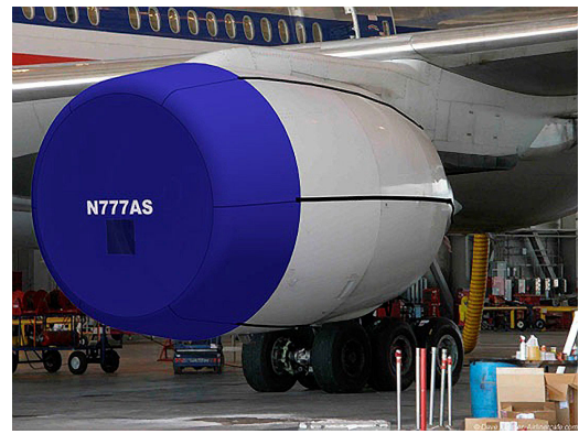
Boeing 777 Intake Cover, GE Engine