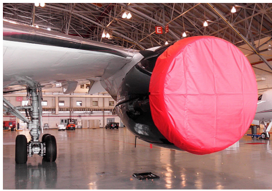
Boeing 767 Intake Covers, P/N: B767-105