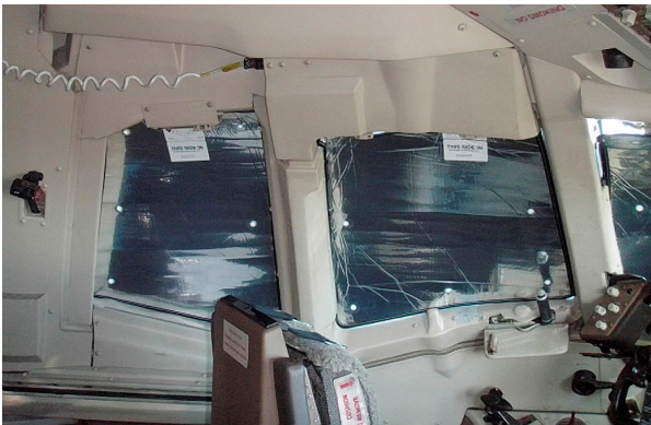
Boeing 767 Cockpit HeatShield set

Cockpit Heatshields are interior sunshades for the aircraft's cockpit. The product is a unique composite of closed-cell foam with a silver mylar finish. The semi-rigid design is stiff enough to stand inside the window framing. The set folds up flat and is easily stored in the included storage sleeve. Some designs may require velcro and suction cups. Our Heatshields for jets are offered white side out because some aircraft manufacturers have issued advisories against reflective window inserts due to potential heat damage. A Heatshield is an excellent short-term remedy for cockpit overheating, but an external fabric cover is more effective for long-term protection.