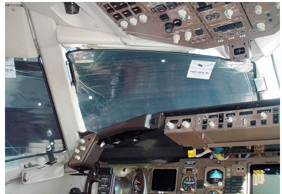
Boeing 767 Cockpit HeatShield set