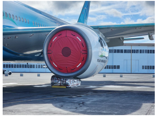
Boeing 777 Intake Plugs, Folding Type