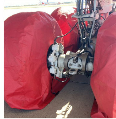
Boeing 777 Main Gear Tire Covers