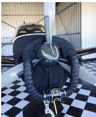
Beech Bonanza 36 Models Insulated Engine Cover

This cover type is made from Silver Acrylic Sunbrella canvas and is 100% lined with a soft and smooth microfiber. Bruce's Custom Covers developed this material combination especially for aircraft protection. The outer material is medium weight and treated for water resistance, UV resistance and anti-static buildup. The inner lining is a very soft and smooth microfiber to prevent scratching. The material is very reflective, and tests show that the cabin interior temperature can be reduced to near-ambient temperature on the hottest of days. It is water, ice and snow repellent, yet breathable to allow moisture to escape from between the cover and the aircraft surface.