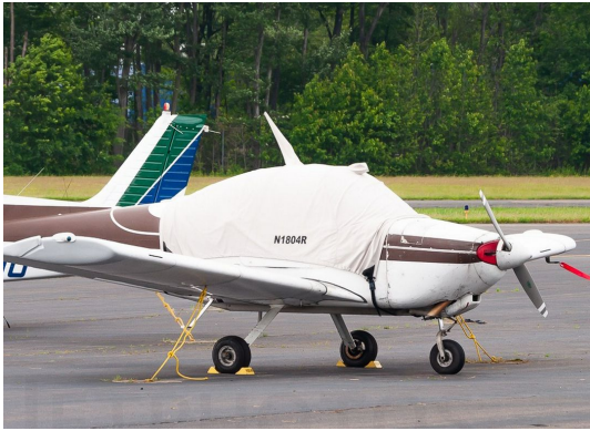
Beech B77 Skipper Canopy Cover

This cover type is made from Silver Acrylic Sunbrella canvas and is 100% lined with a soft and smooth microfiber. Bruce's Custom Covers developed this material combination especially for aircraft protection. The outer material is medium weight and treated for water resistance, UV resistance and anti-static buildup. The inner lining is a very soft and smooth microfiber to prevent scratching. The material is very reflective, and tests show that the cabin interior temperature can be reduced to near-ambient temperature on the hottest of days. It is water, ice and snow repellent, yet breathable to allow moisture to escape from between the cover and the aircraft surface.