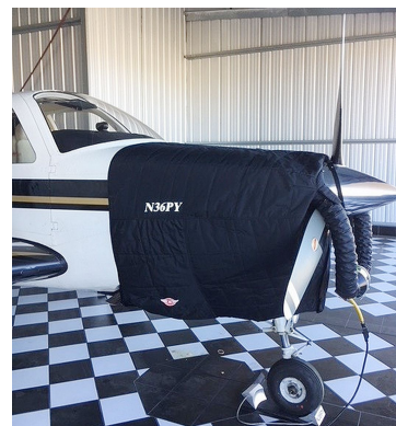
Beech Bonanza 36 Models Insulated Engine Cover