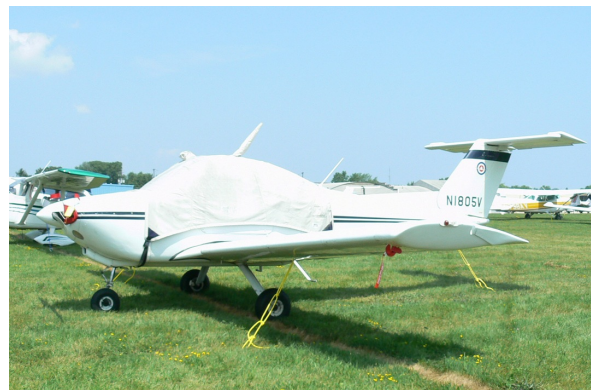
Beech Skipper Canopy Cover, Engine Plugs