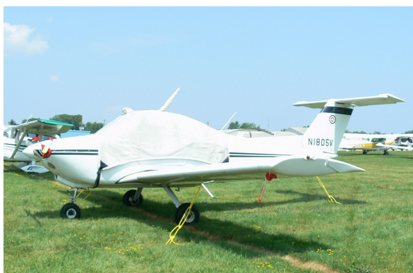
Beech Skipper Canopy Cover, Engine Plugs

Travel Covers are made with Silver Solution-Dyed Polyester fabric and only lined over the windshield to save weight. The material is lightweight and more compact for easy stowage in the aircraft. The polyester material is water resistant, but only intended for occasional use outside. We also have an ultra lightweight material available for fitted hangar dust covers. For daily outdoor use, the non-travel Sunbrella Cover is the best choice.