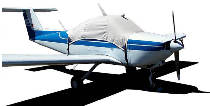
Canopy Cover for Beech Skipper