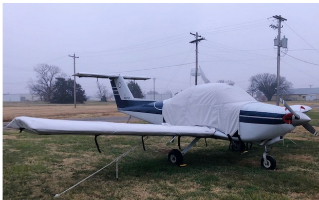
Beech Skipper Extended Canopy Cover, Wing & Horiz. Stab. Covers

plugs are imprinted with the aircraft registration number in black for an extra charge. Storage bag NOT included. Engine plugs may be inserted after flight when the engine is still warm. Engine Inlet Plugs are commonly referred to as Cowl Plugs, Intake Plugs, Cowl Blocks, Engine Blocks, and Engine Bungs.