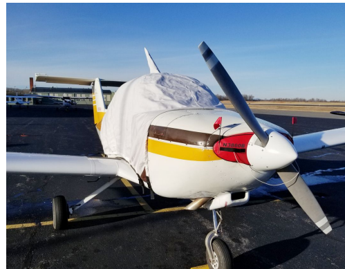
Beech Skipper Extended Canopy Cover and Inlet Plugs