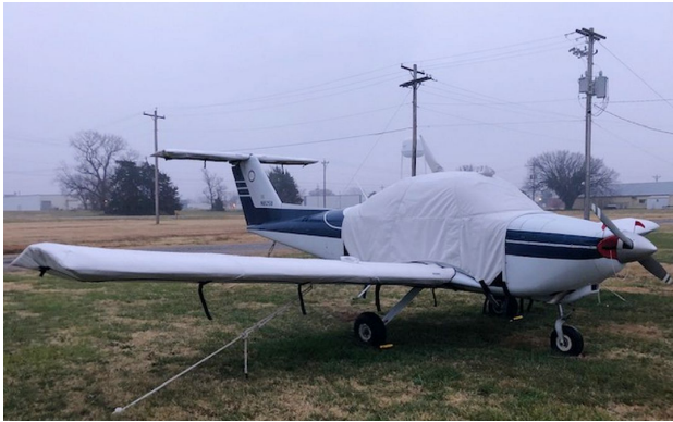
Beech Skipper Extended Canopy Cover, Wing & Horiz. Stab. Covers

plugs are imprinted with the aircraft registration number in black for an extra charge. Storage bag NOT included. Engine plugs may be inserted after flight when the engine is still warm. Engine Inlet Plugs are commonly referred to as Cowl Plugs, Intake Plugs, Cowl Blocks, Engine Blocks, and Engine Bungs.