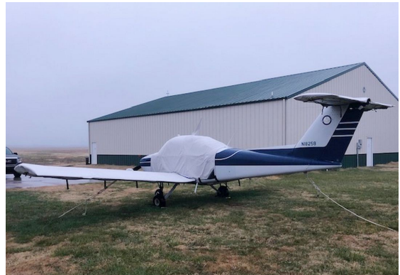
Beech Skipper Extended Canopy Cover, Wing & Horiz. Stab. Covers