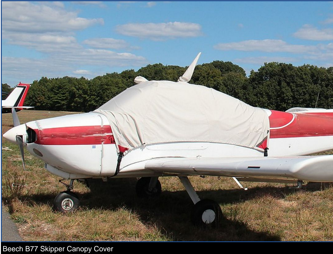
Beech B77 Skipper Canopy Cover