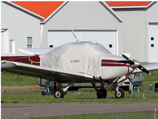
Beech B77 Skipper Extended Canopy Cover

This cover type is made from Silver Acrylic Sunbrella canvas and is 100% lined with a soft and smooth microfiber. Bruce's Custom Covers developed this material combination especially for aircraft protection. The outer material is medium weight and treated for water resistance, UV resistance and anti-static buildup. The inner lining is a very soft and smooth microfiber to prevent scratching. The material is very reflective, and tests show that the cabin interior temperature can be reduced to near-ambient temperature on the hottest of days. It is water, ice and snow repellent, yet breathable to allow moisture to escape from between the cover and the aircraft surface.