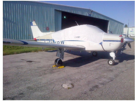
Beech Sierra Canopy Cover, Engine Plugs, Tailcone Cover