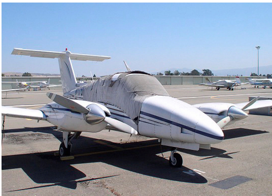
Beech Duchess Canopy Cover

This cover type is made from Silver Acrylic Sunbrella canvas and is 100% lined with a soft and smooth microfiber. Bruce's Custom Covers developed this material combination especially for aircraft protection. The outer material is medium weight and treated for water resistance, UV resistance and anti-static buildup. The inner lining is a very soft and smooth microfiber to prevent scratching. The material is very reflective, and tests show that the cabin interior temperature can be reduced to near-ambient temperature on the hottest of days. It is water, ice and snow repellent, yet breathable to allow moisture to escape from between the cover and the aircraft surface.