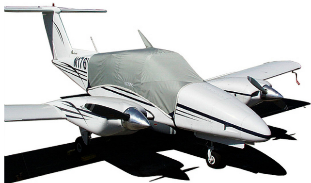
Duchess Standard Canopy Cover