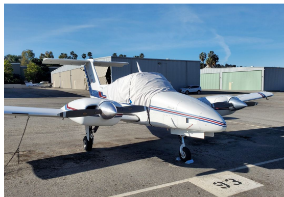
Beech Duchess Canopy Cover