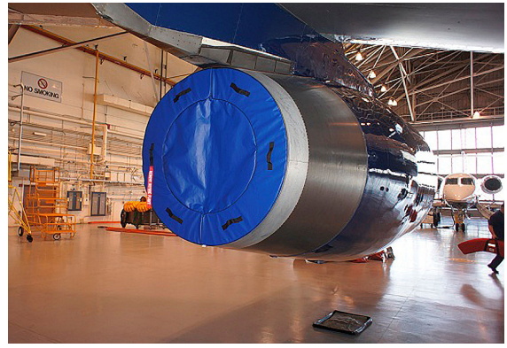
Boeing 757 Exhaust Plugs