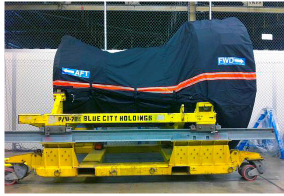
QEC Off-link Engine Cover / Tarp / Bag