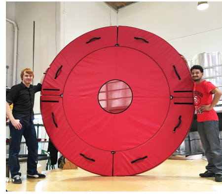
Boeing 787 Intake Plug, framed bi-fold type