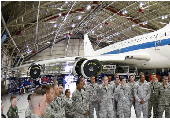
BOEING E-4B INTAKE COVERS