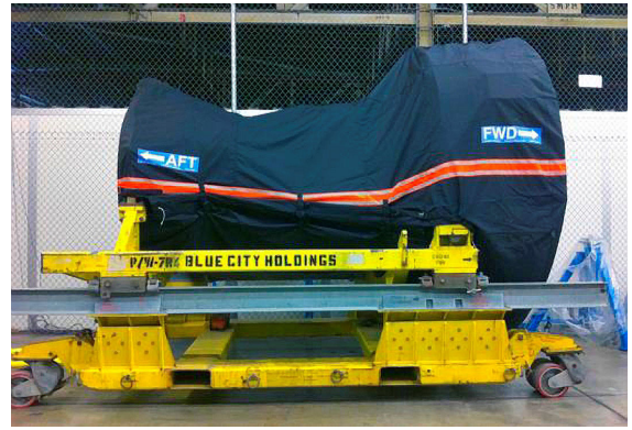
QEC Off-link Engine Cover / Tarp / Bag