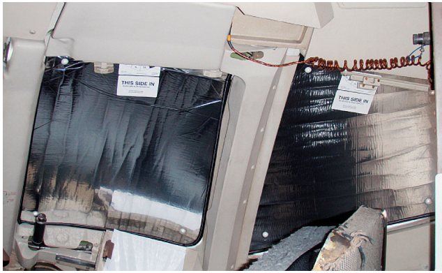
Boeing 757 Cockpit HeatShield set