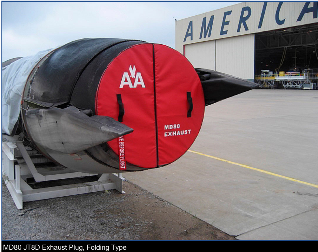
MD80 JT8D Exhaust Plug, Folding Type