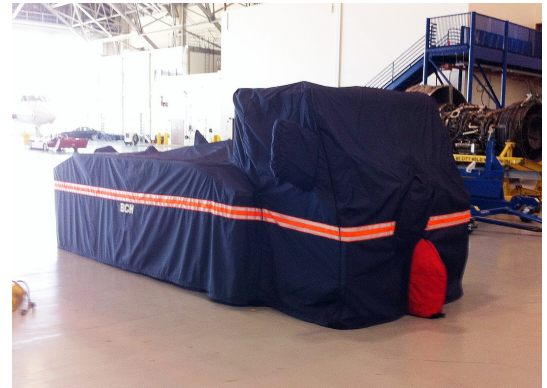
Complete Cover for Eagle Tug