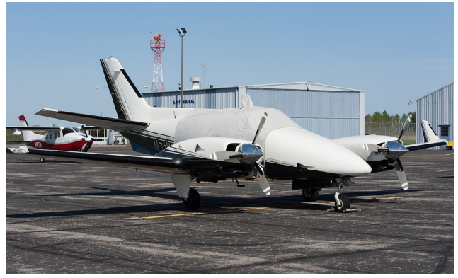
Beech Duke Canopy Cover