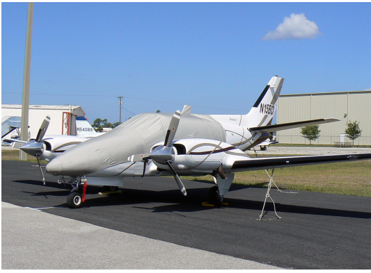
Beech Duke Canopy/Nose Cover