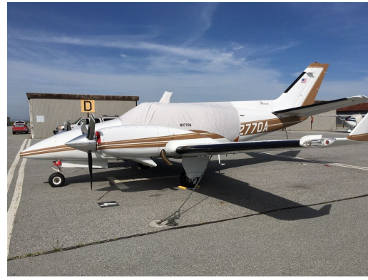
Beech Duke Canopy Cover, Engine Plugs, Pitot Covers