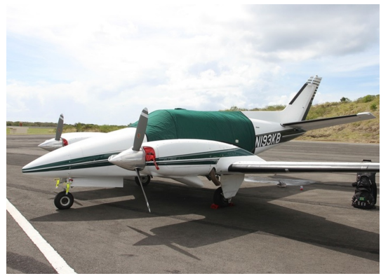
Beech Duke Canopy Cover, Engine Plugs