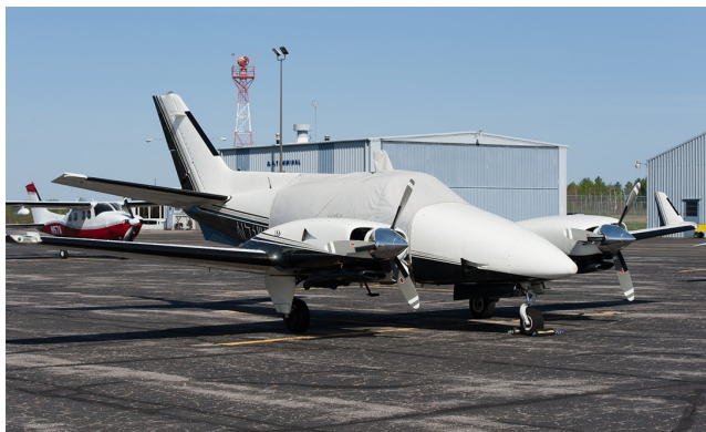
Beech Duke Canopy Cover