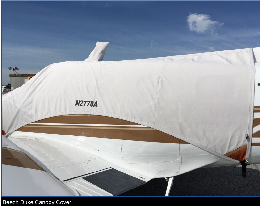
Beech Duke Canopy Cover