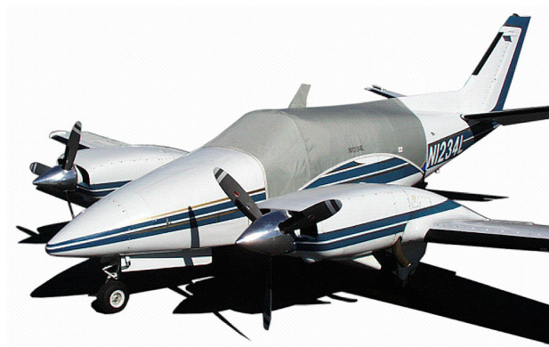
Beech Duke Standard Canopy Cover