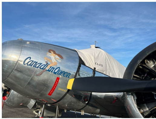
Beech B18 Cockpit Cover