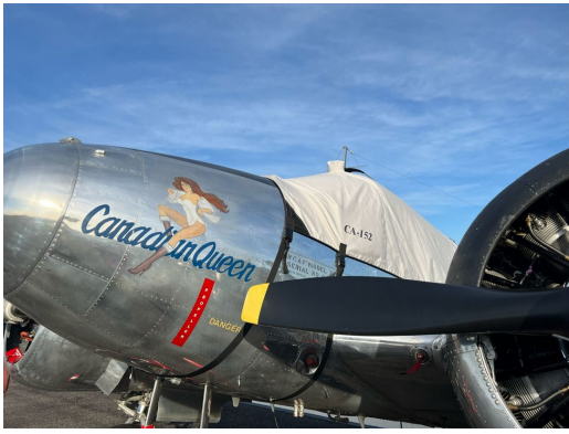
Beech B18 Cockpit Cover