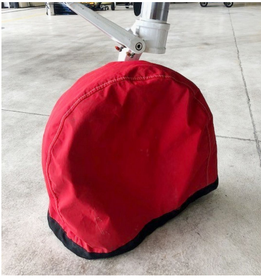
Beech King Air 300 Tire Covers (nose gear)