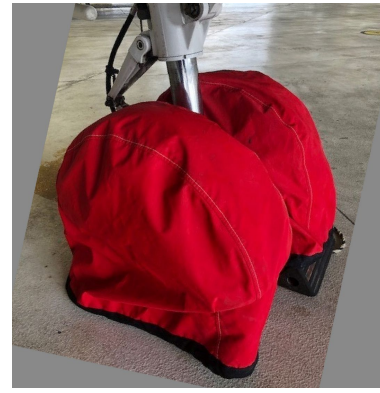
Beech King Air 300 Tire Covers (main gear)