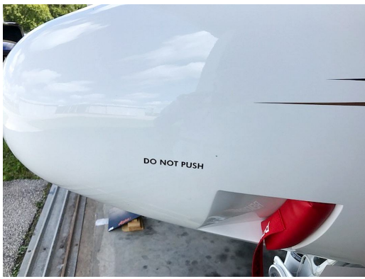
Beech Baron Nose Air Inlet Plugs, set of 2