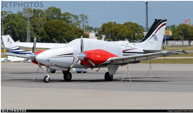
Beech Baron 58, G58 Canopy Cover, Insulated Engine Covers

Covers developed this material combination especially for aircraft protection. The outer material is medium weight and treated for water resistance, UV resistance and anti-static buildup. The inner lining is a very soft and smooth microfiber to prevent scratching. The material is very reflective, and tests show that the cabin interior temperature can be reduced to near-ambient temperature on the hottest of days. It is water, ice and snow repellent, yet breathable to allow moisture to escape from between the cover and the aircraft surface.