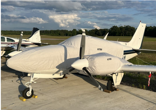
Beech C55 Baron Extended Canopy/Nose Cover, Engine Covers

This cover type is made from Silver Acrylic Sunbrella canvas and is 100% lined with a soft and smooth microfiber. Bruce's Custom Covers developed this material combination especially for aircraft protection. The outer material is medium weight and treated for water resistance, UV resistance and anti-static buildup. The inner lining is a very soft and smooth microfiber to prevent scratching. The material is very reflective, and tests show that the cabin interior temperature can be reduced to near-ambient temperature on the hottest of days. It is water, ice and snow repellent, yet breathable to allow moisture to escape from between the cover and the aircraft surface.