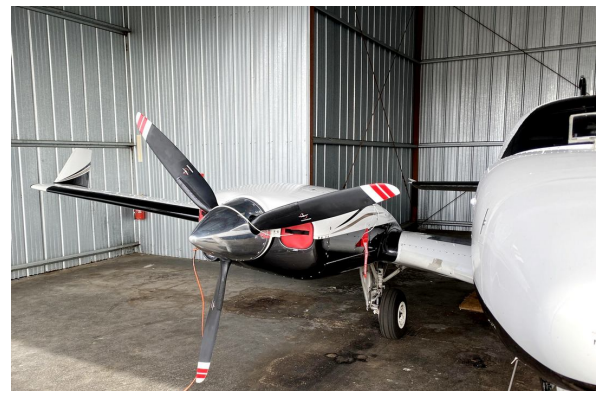
Baron 58 Engine Plugs