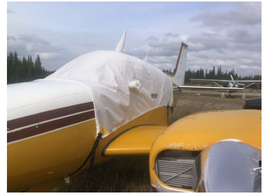
Beech A55 Baron Canopy Cover