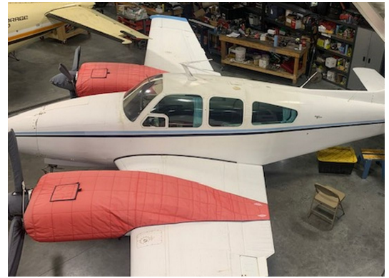
Beech Baron B55 Insulated Engine Covers