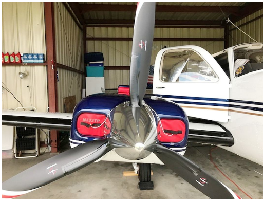
Beech Baron 58 Engine Inlet Plugs & Cowl Top Plugs