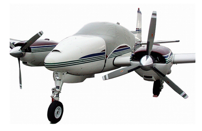
Twin Bonanza Standard Canopy Cover

Travel Covers are made with Silver Solution-Dyed Polyester fabric and only lined over the windshield to save weight. The material is lightweight and more compact for easy stowage in the aircraft. The polyester material is water resistant, but only intended for occasional use outside. We also have an ultra lightweight material available for fitted hangar dust covers. For daily outdoor use, the non-travel Sunbrella Cover is the best choice.