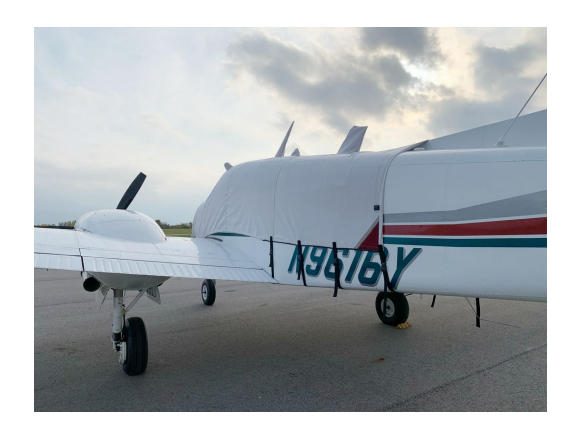
Beech Twin Bonanza Canopy/Nose Cover

This cover type is made from Silver Acrylic Sunbrella canvas and is 100% lined with a soft and smooth microfiber. Bruce's Custom Covers developed this material combination especially for aircraft protection. The outer material is medium weight and treated for water resistance, UV resistance and anti-static buildup. The inner lining is a very soft and smooth microfiber to prevent scratching. The material is very reflective, and tests show that the cabin interior temperature can be reduced to near-ambient temperature on the hottest of days. It is water, ice and snow repellent, yet breathable to allow moisture to escape from between the cover and the aircraft surface.