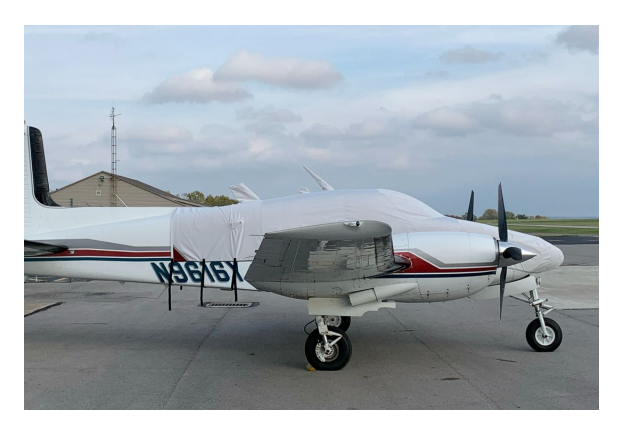
Beech Twin Bonanza Canopy/Nose Cover