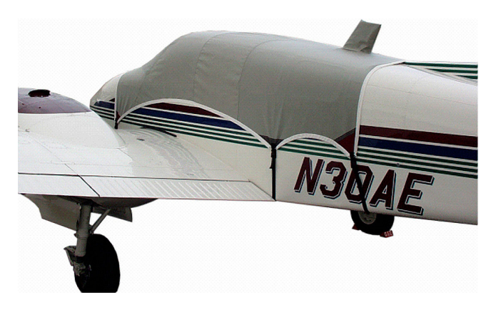
Twin Bonanza Standard Canopy Cover