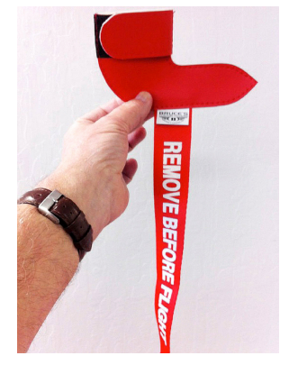
Twin Bonanza Plugs